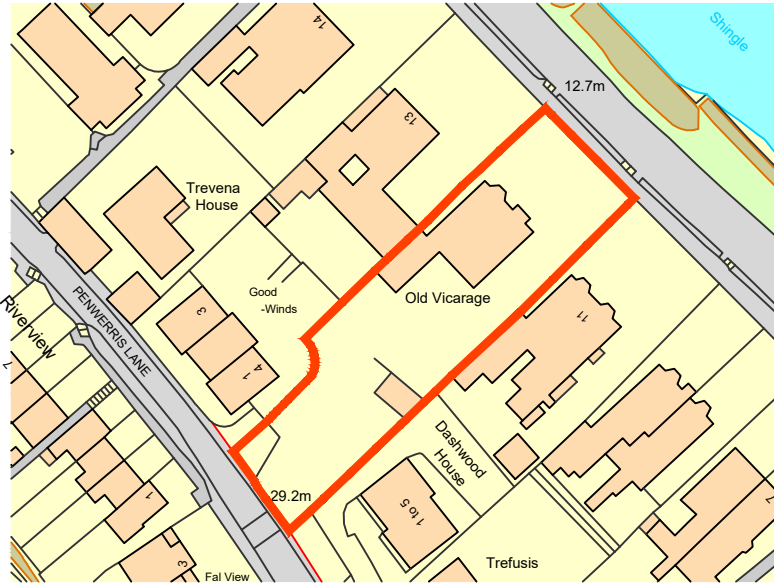
Site Plan Scale 1:1250