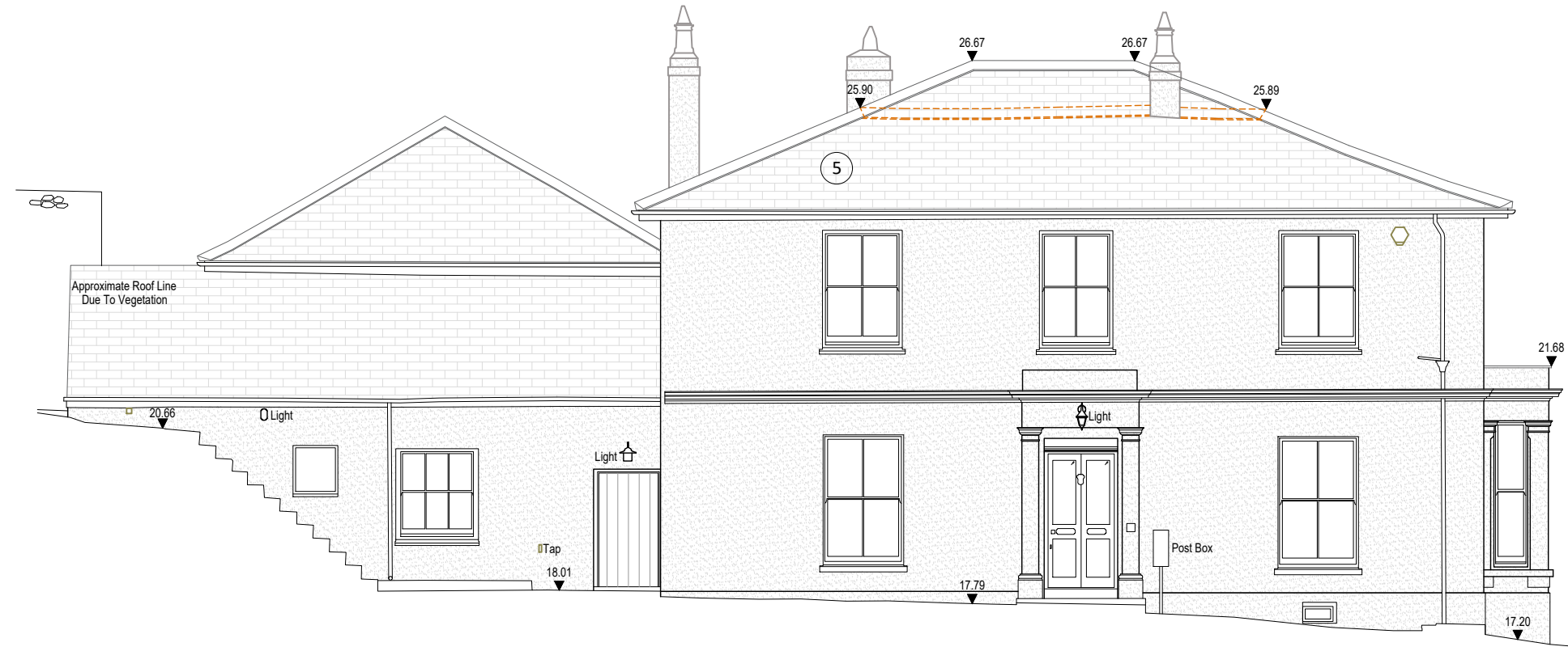
Proposed South East Elevation Scale 1:100