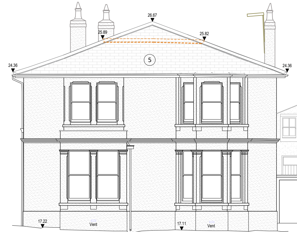
Proposed North East Elevation Scale 1:100