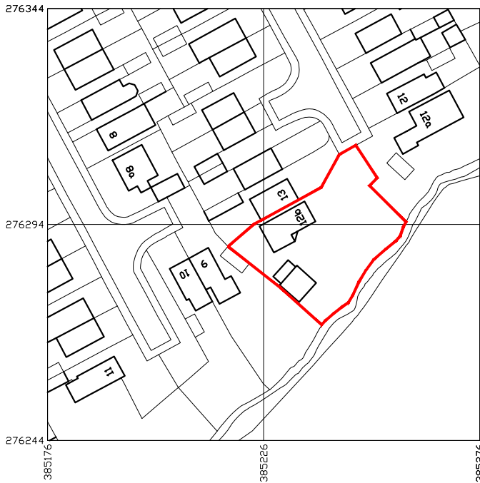
Site Location Plan - 1:1250