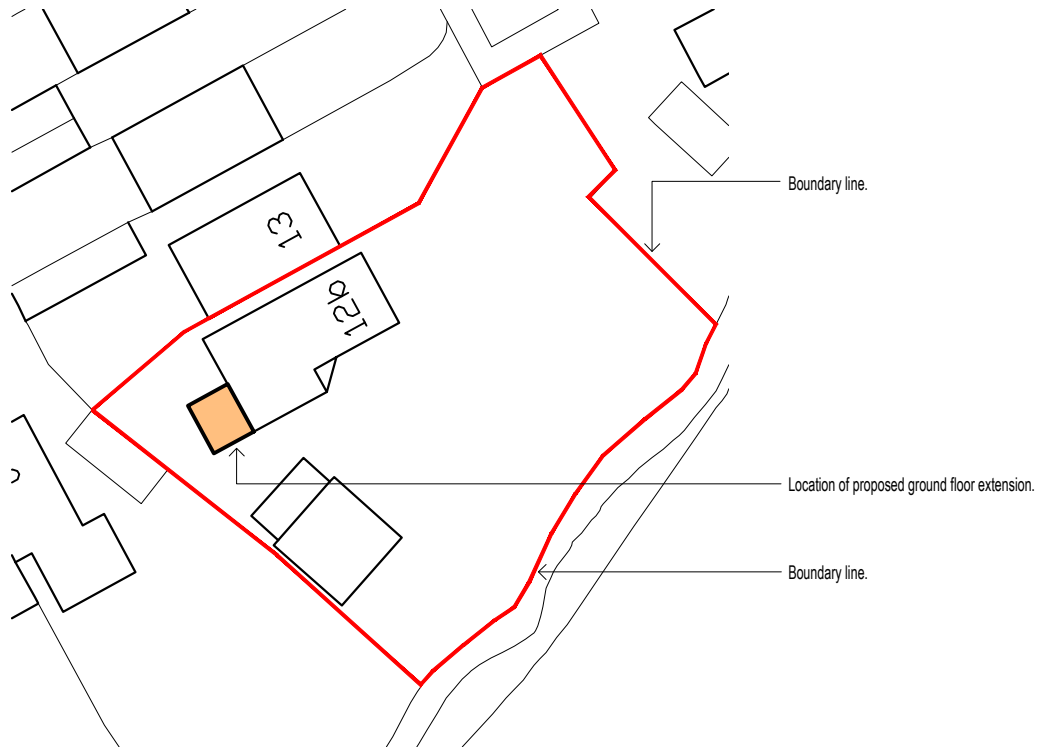
Site Plan - 1:500