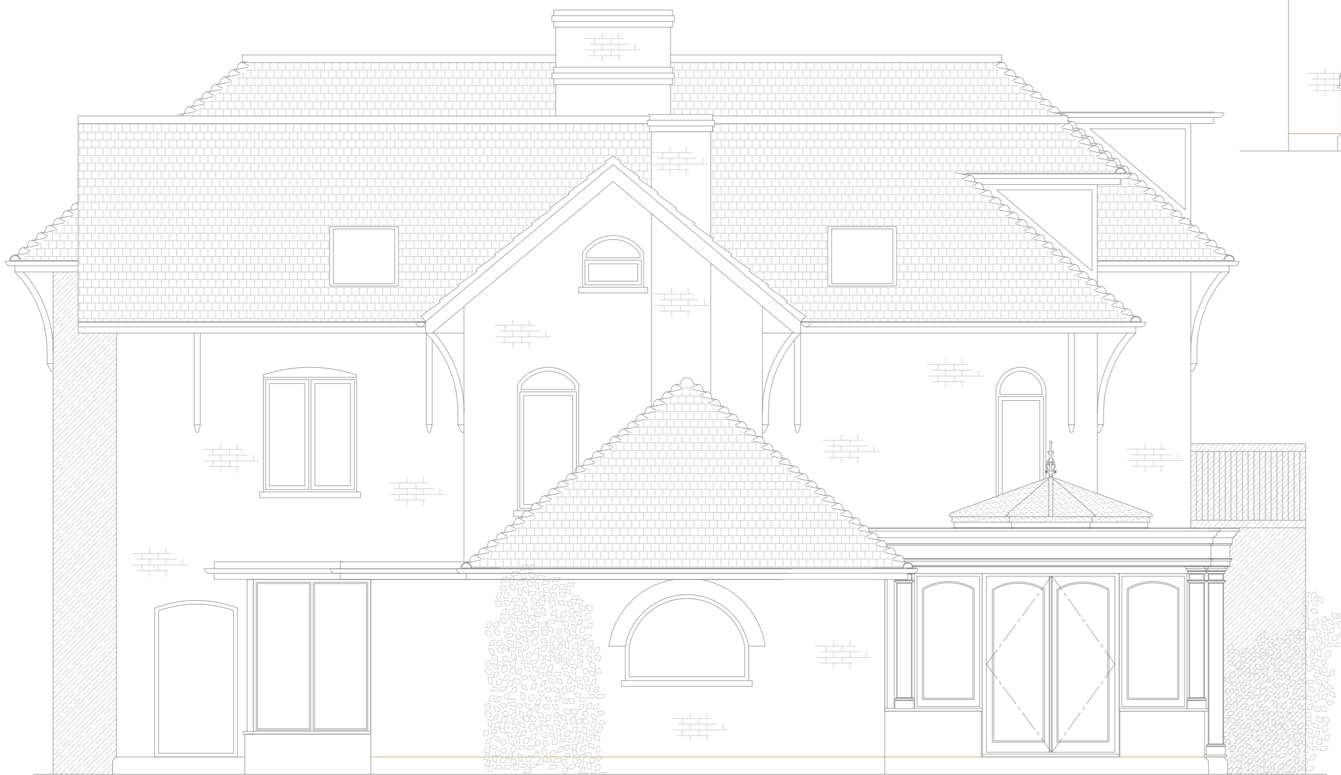
Proposed Side Elevation Scale 1:50