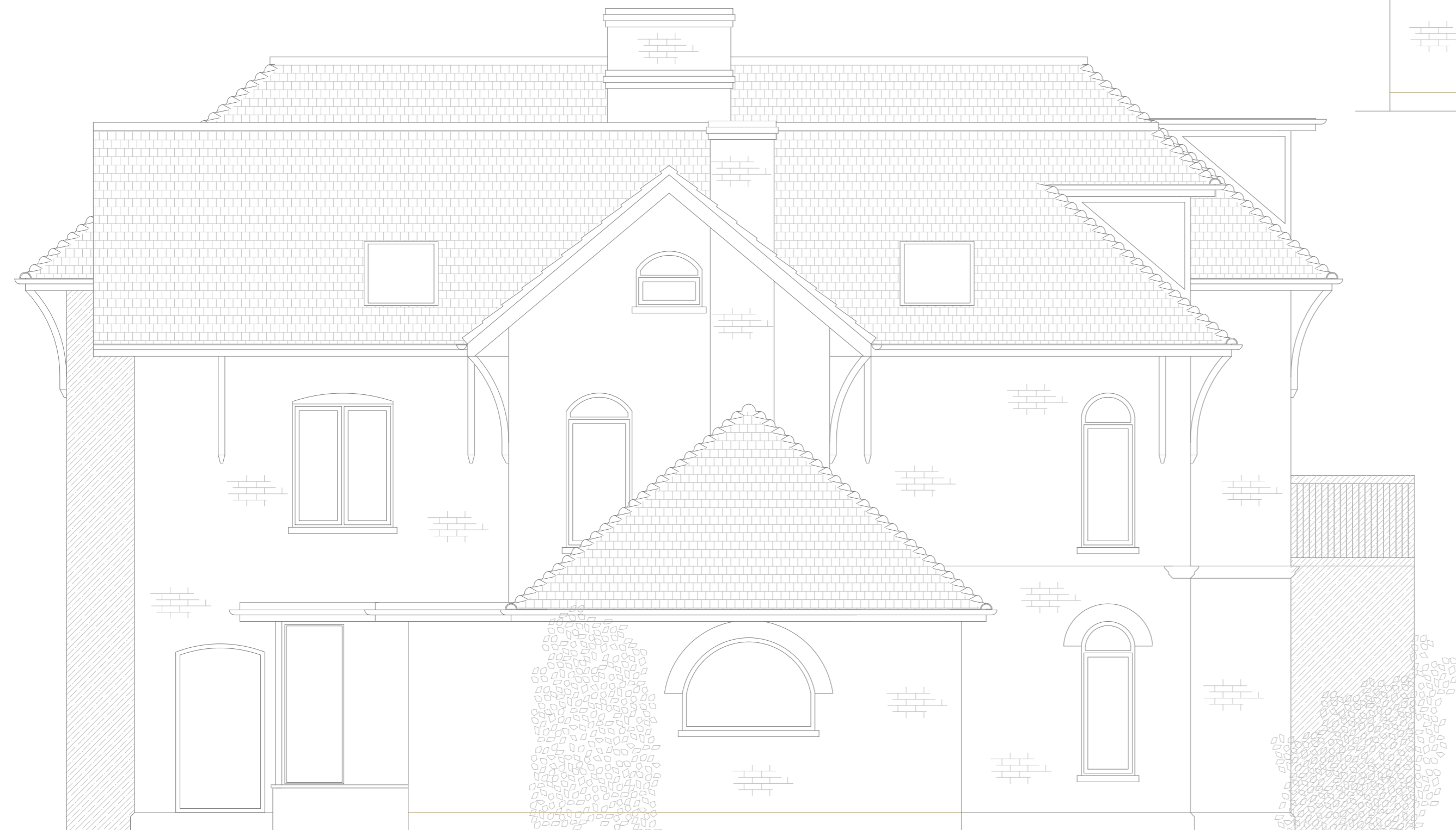
Existing Side Elevation Scale 1:50