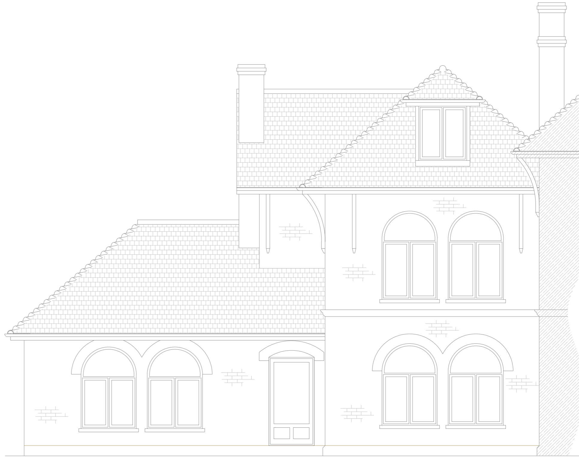
Existing Rear Elevation Scale 1:50