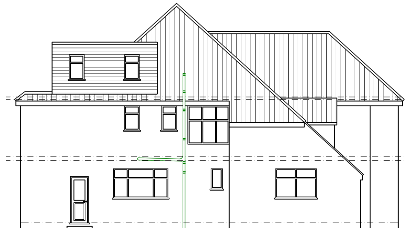
EXISTING RIGHT SIDE ELEVATION