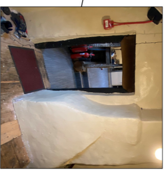
EXISTING DOOR LIVING INTO KITCHEN AREA