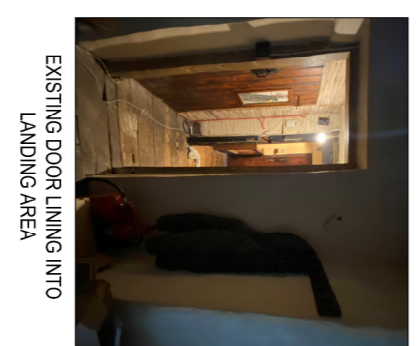
EXISTING DOOR LIVING INTO LANDING AREA