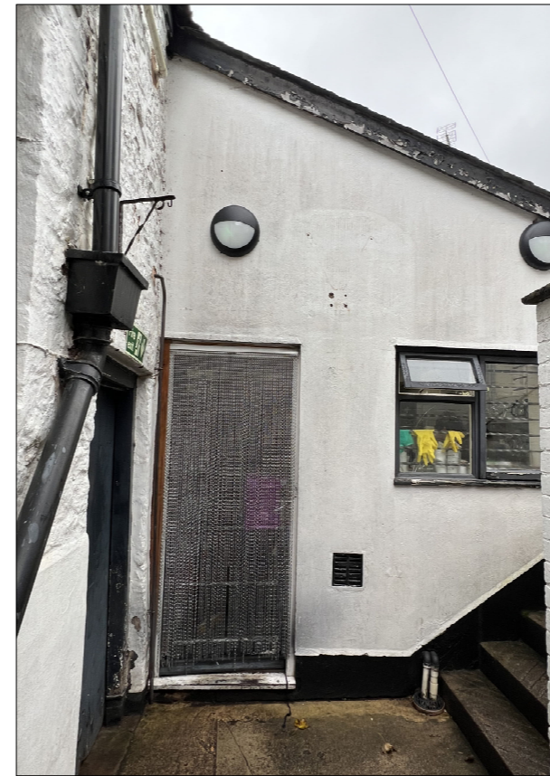
PHOTOGRAPH OF WALL WHERE INLET PROPOSED

Air inlet vent (typical vent illustrated). Refer to 2023-11-18 Statement of Proposed Works v2