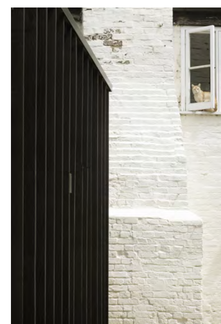
Subservient + Original/proposed relationship + Texture + Connections + Views + Light