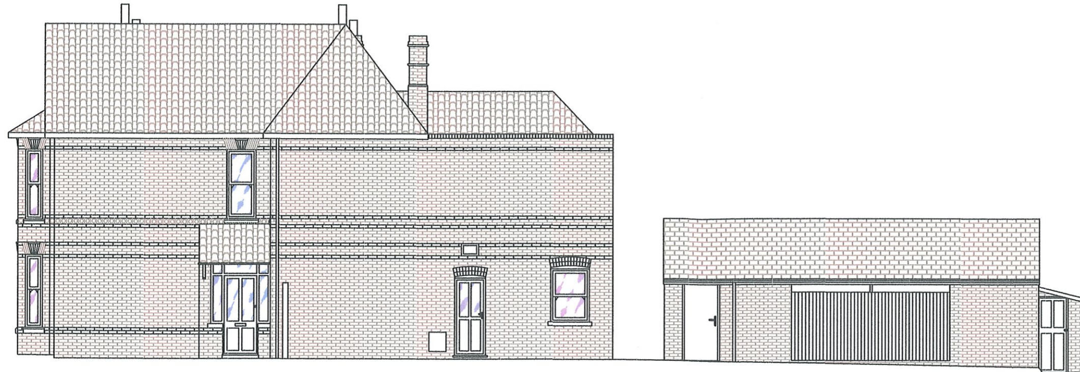
EXISTING SIDE ELEVATION 1

This drawing is the copyright of DAK Draughting Ltd and must not be copied, reproduced or replicated in any way without prior consent