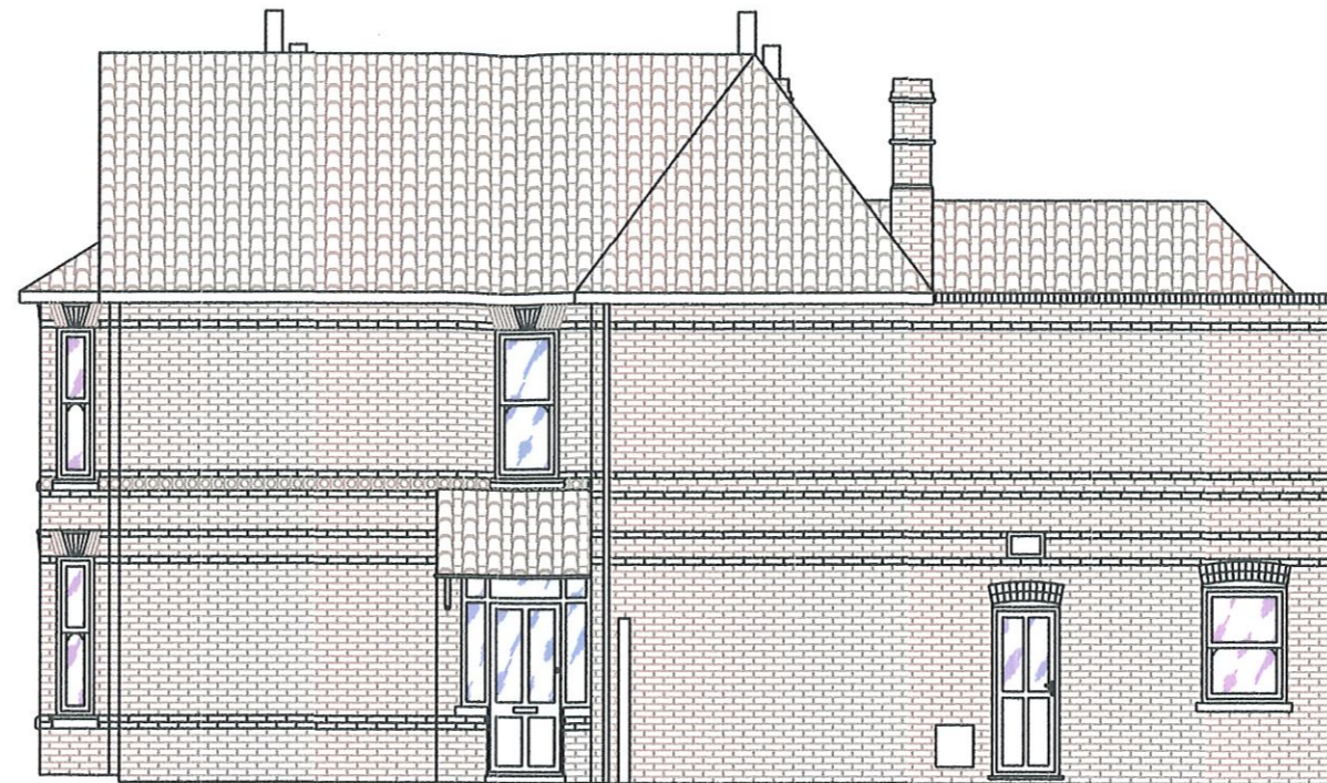
EXISTING SIDE ELEVATION 1