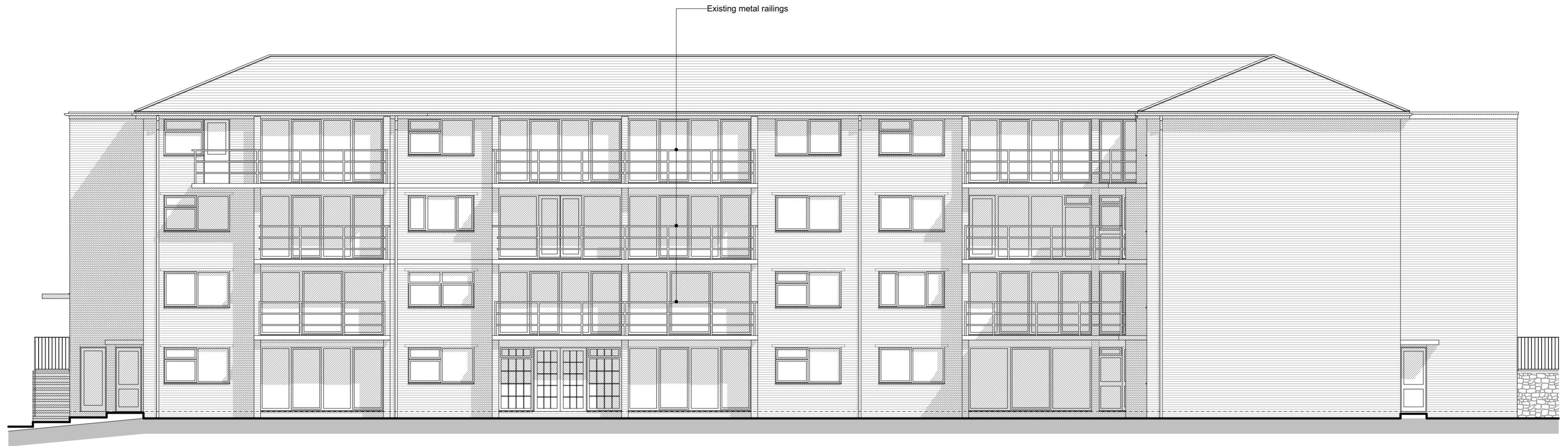
Wickham Court - Existing South Elevation