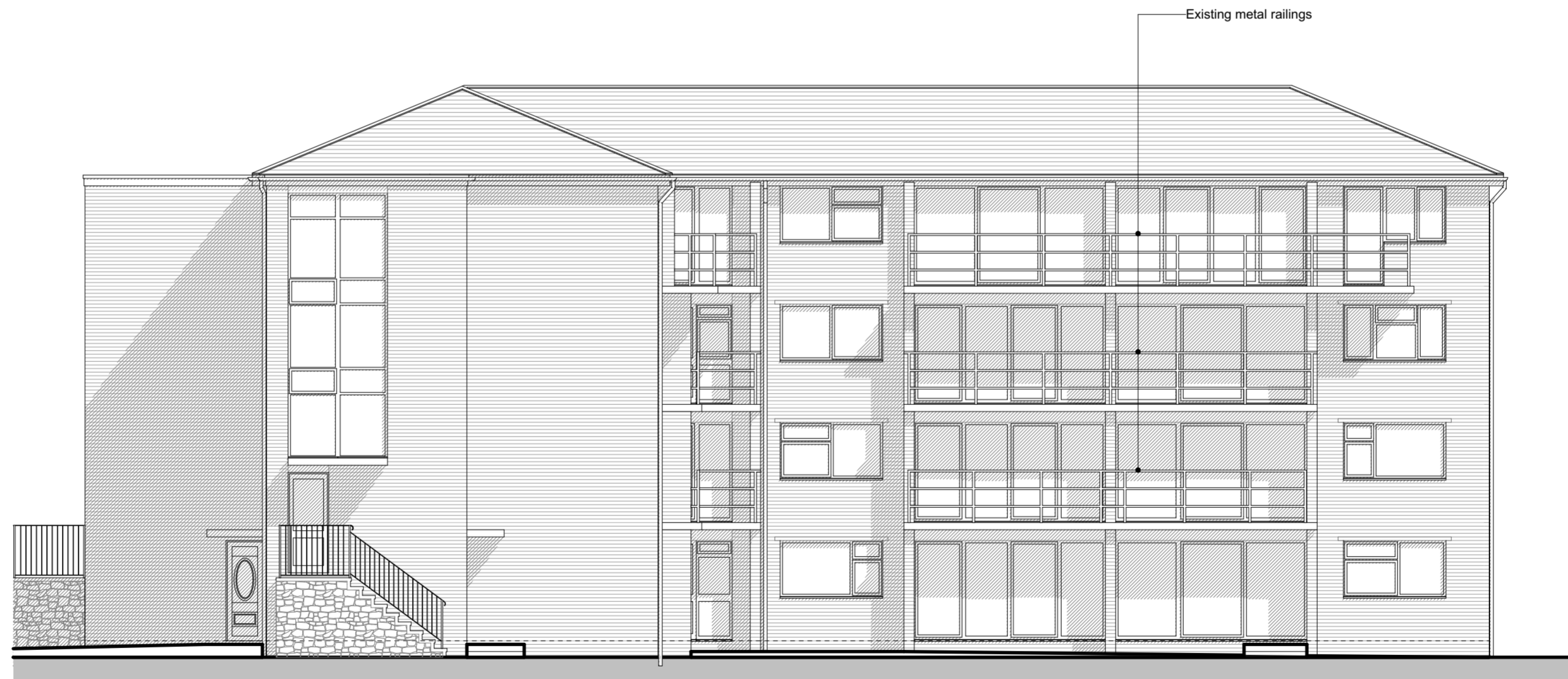
Wickham Court - Existing West Elevation