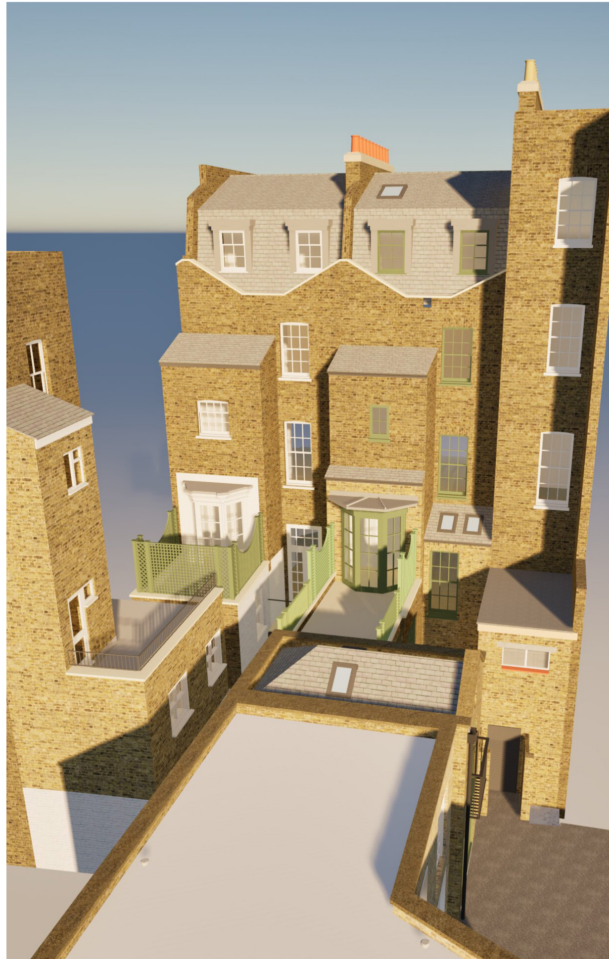
Bird's-eye view looking SE from further away, showing backs of adjacent properties and garage opening onto Moreton Close. Roof of 3 Moreton Close in foreground