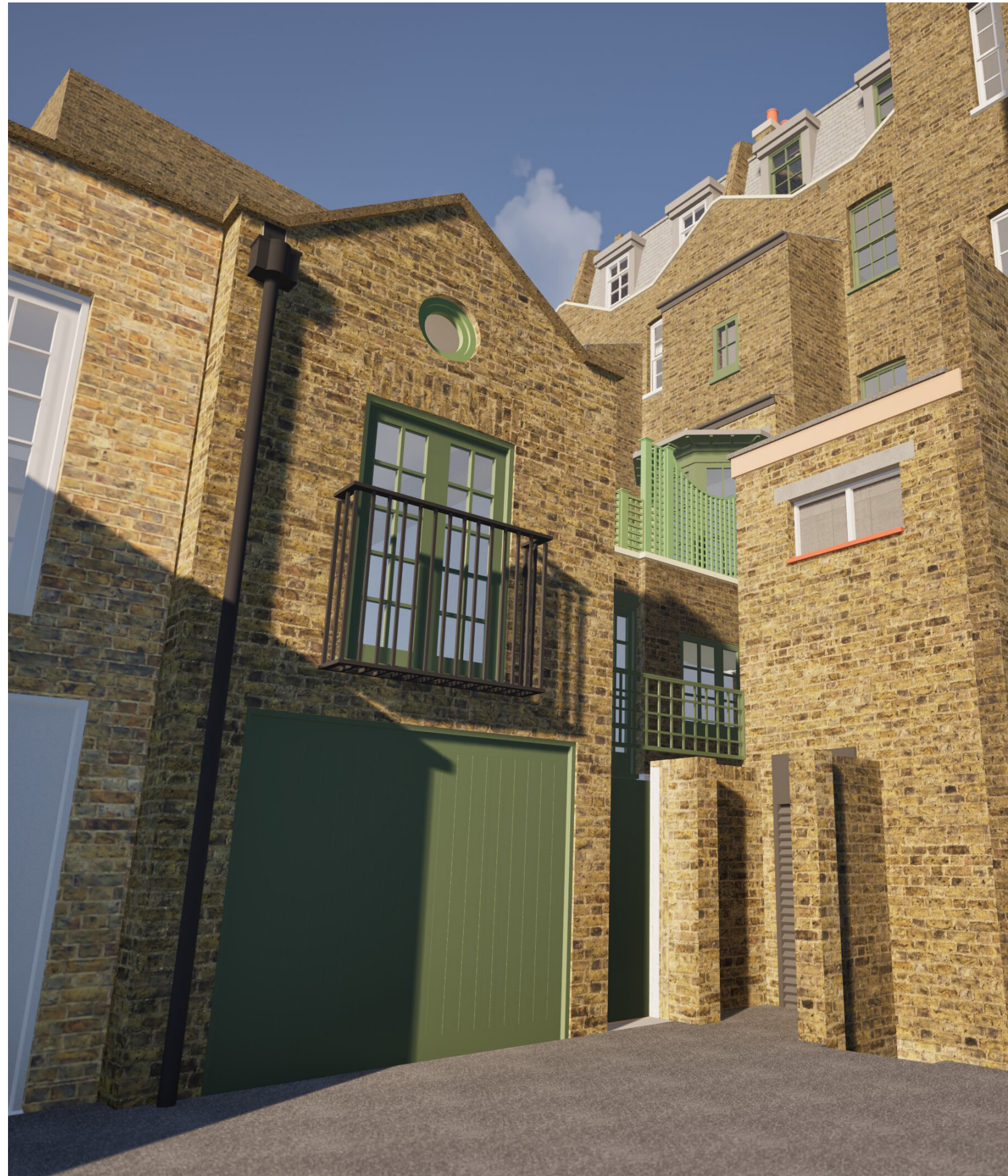
Street level view looking ENE from Moreton Close towards garage block