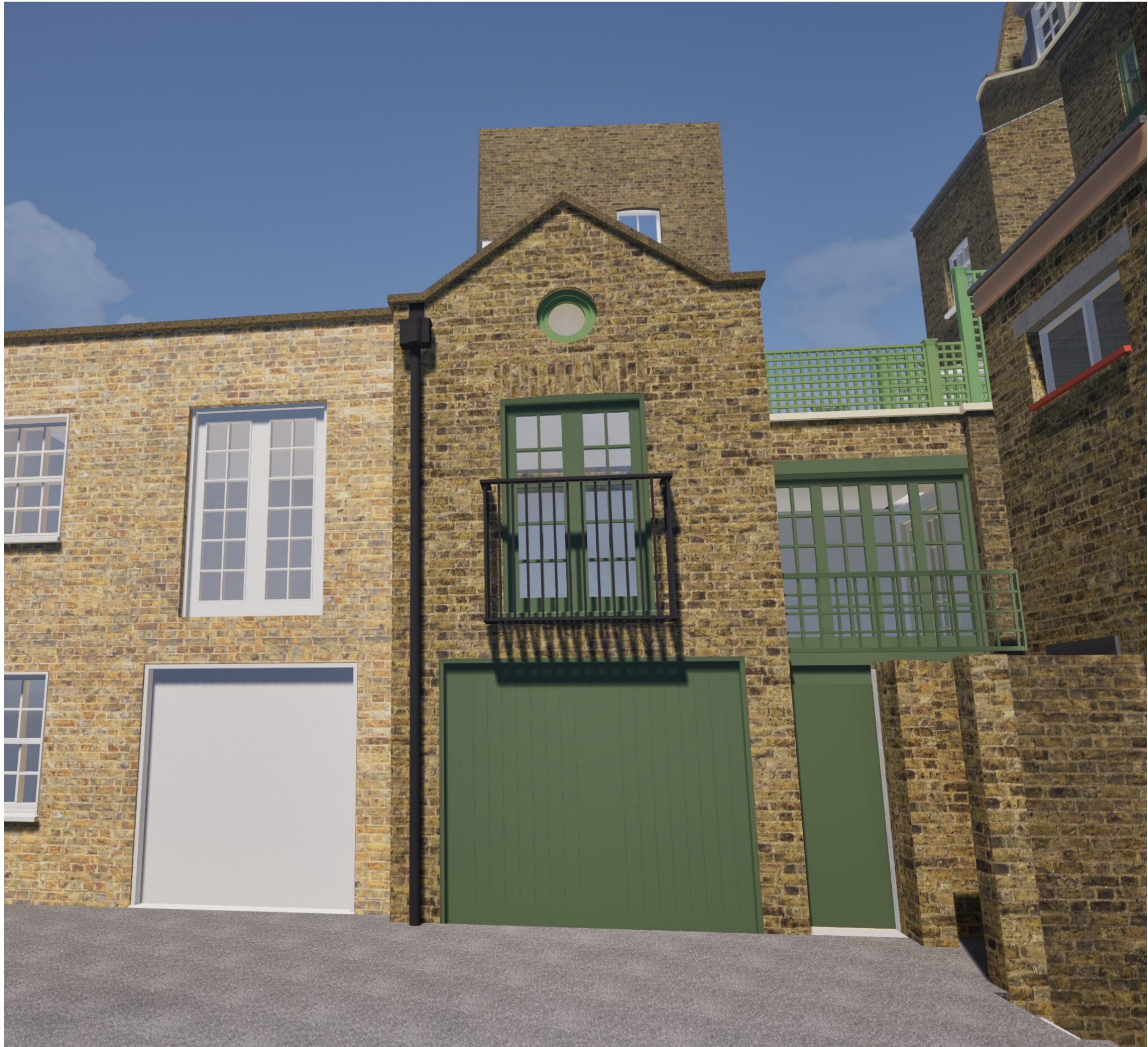
View NE to remodelled garage block from Moreton Close. No.3 Moreton Close to left