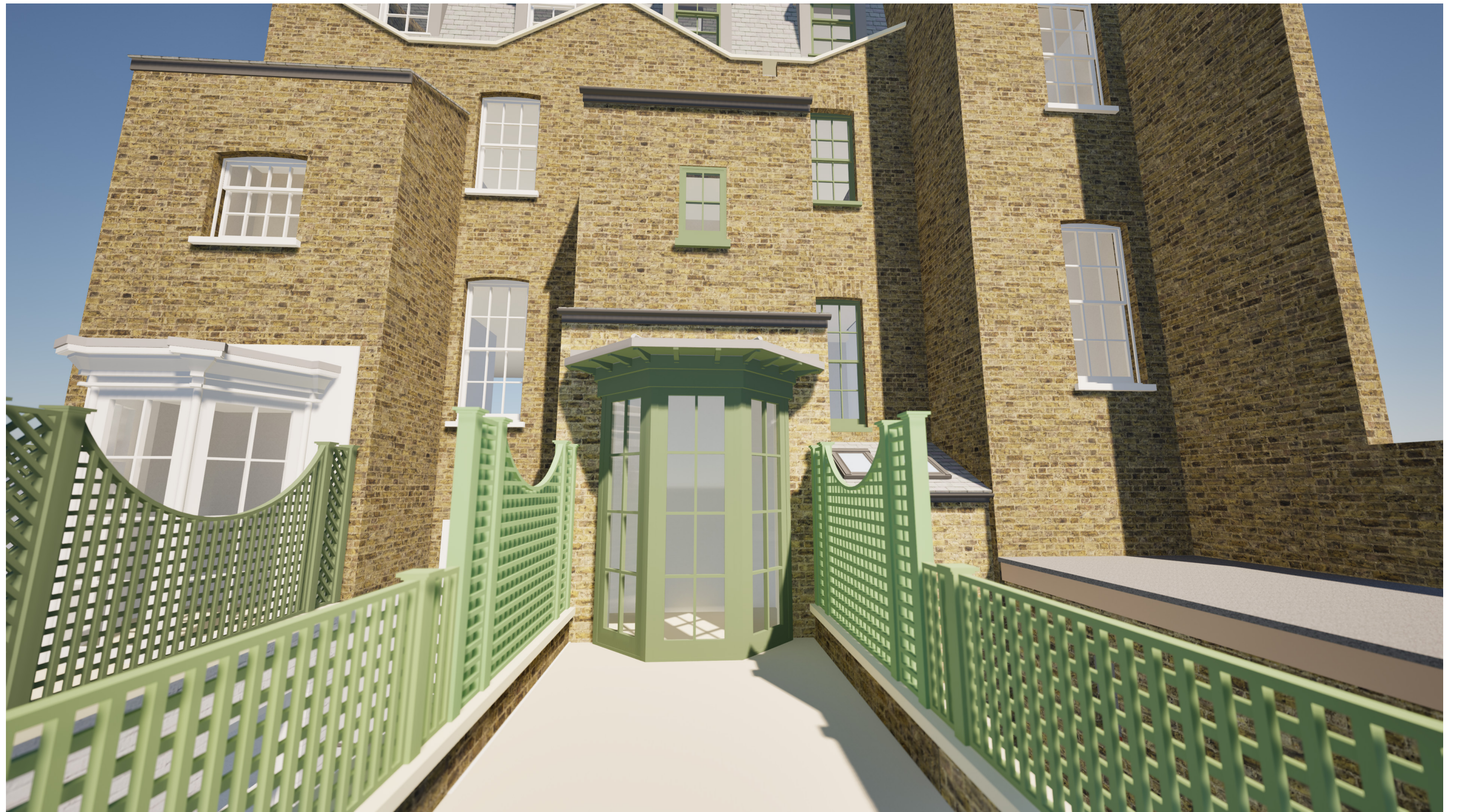
View ESE from terrace towards back of main building, with new bay onto existing terrace. Bay to No.42 to left.