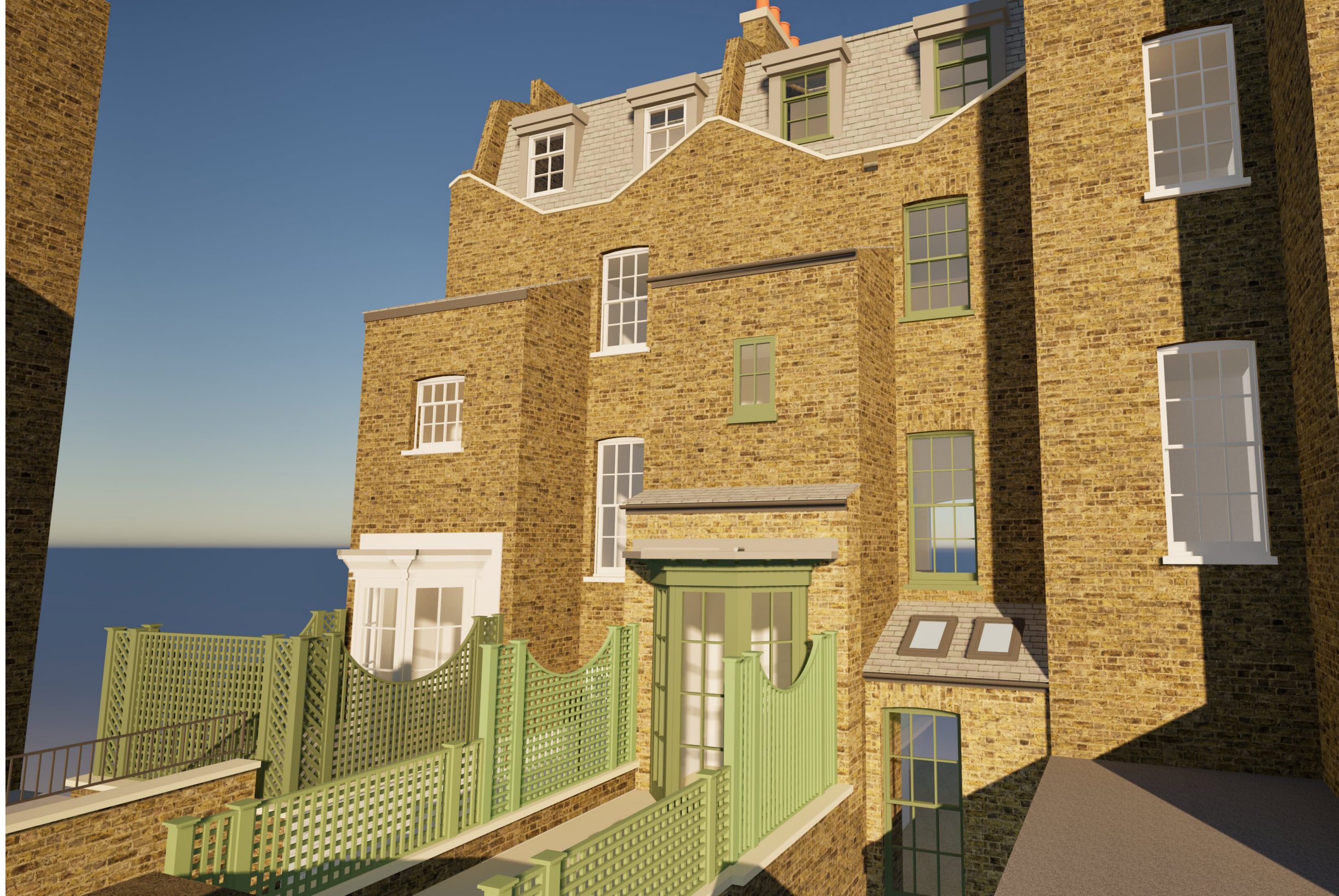
General bird's-eye view of the rear elevation of No.44, with No.42 to left, and part of No.46 modelled to right