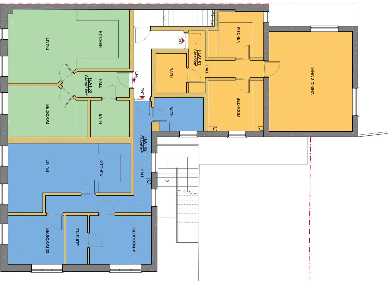
FIRST FLOOR PLAN AS PROPOSED 129 BRIDGE ROAD, MAIDENHEAD, BERKSHIRE - SL6 8NB