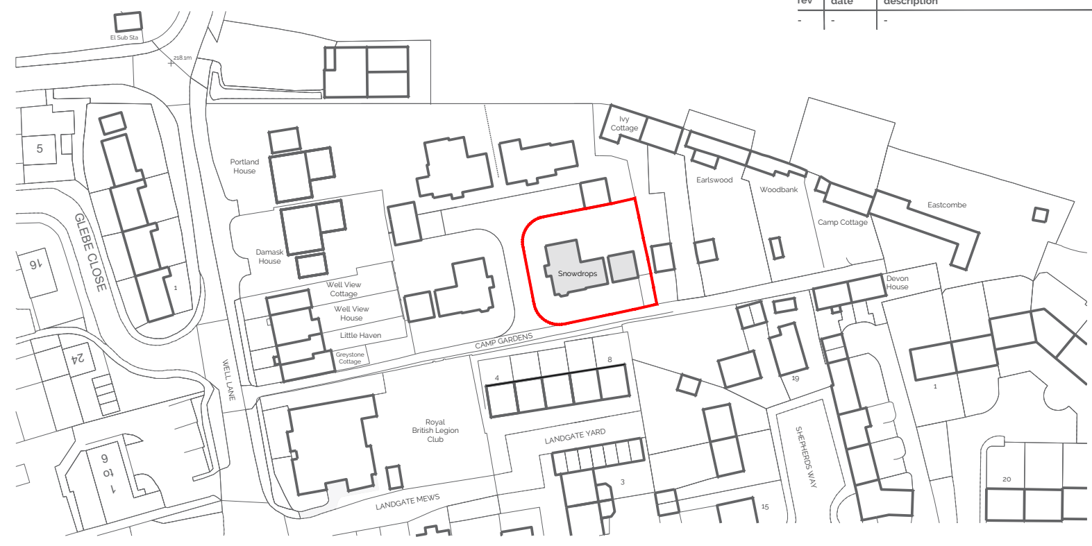
Site Location Plan - 1:1250