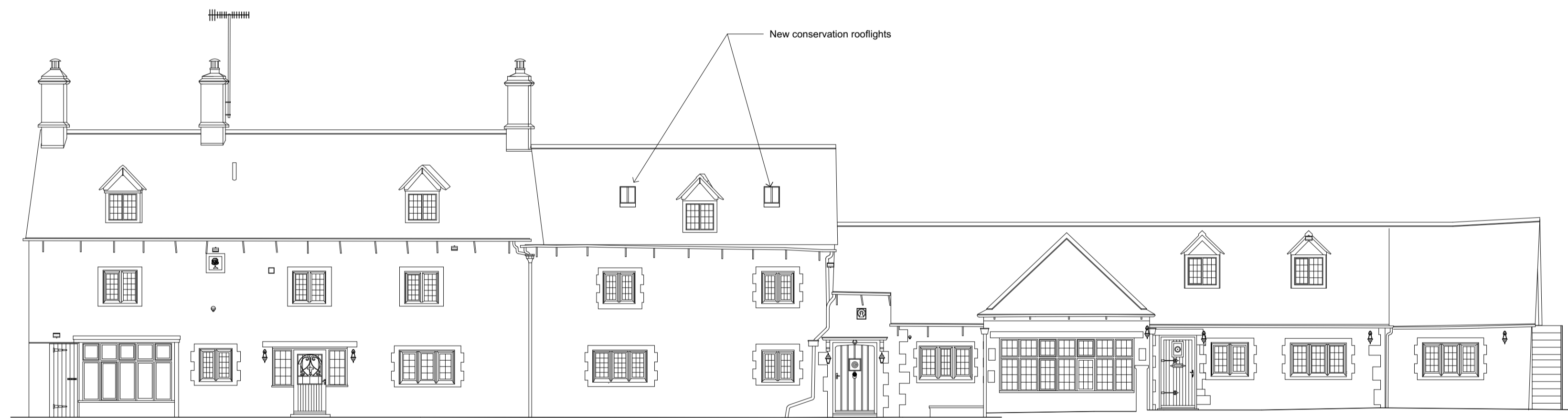
03 South-West (Rear) Elevation 1:100