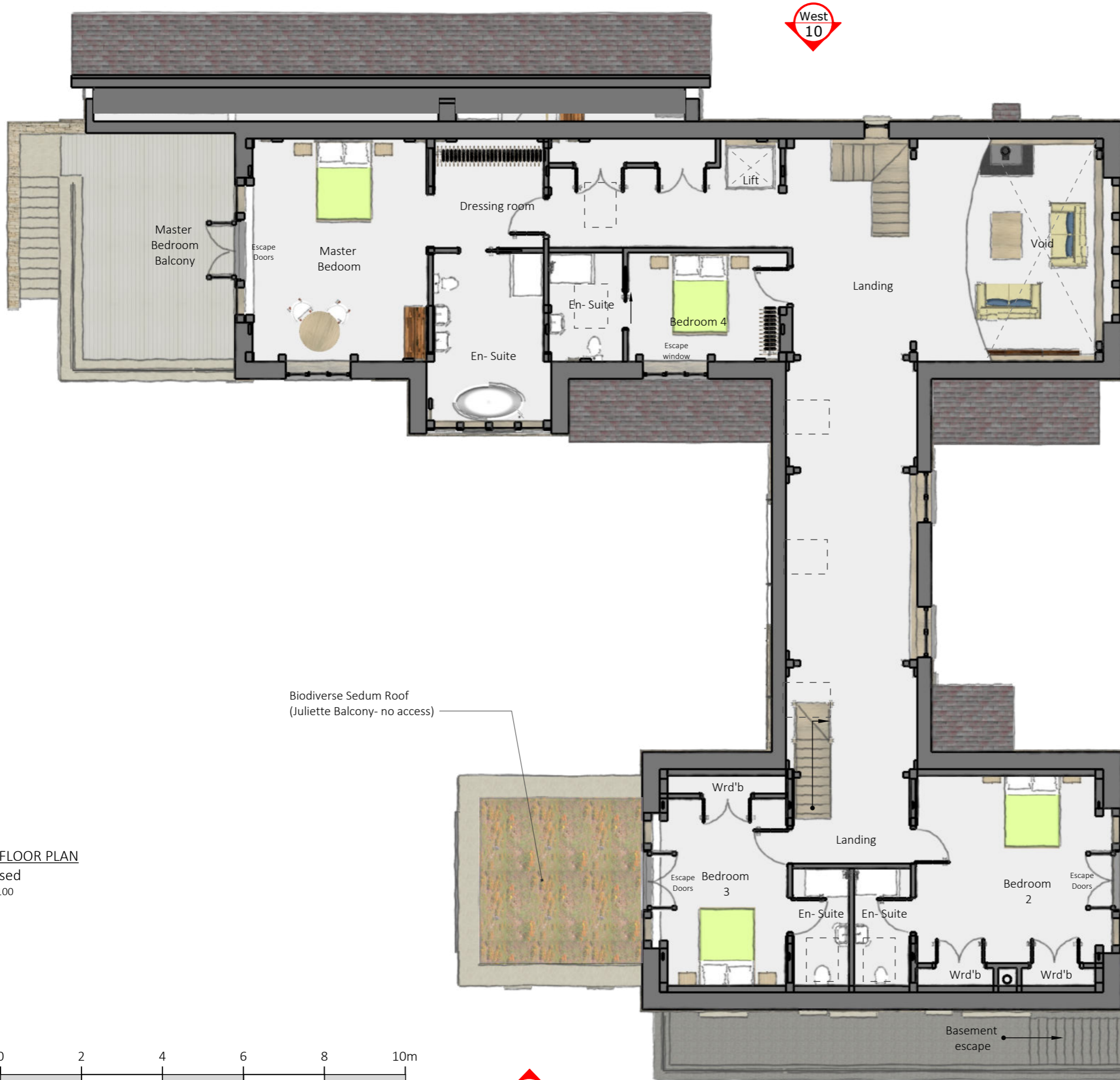
FIRST FLOOR PLAN Proposed Scale 1:100