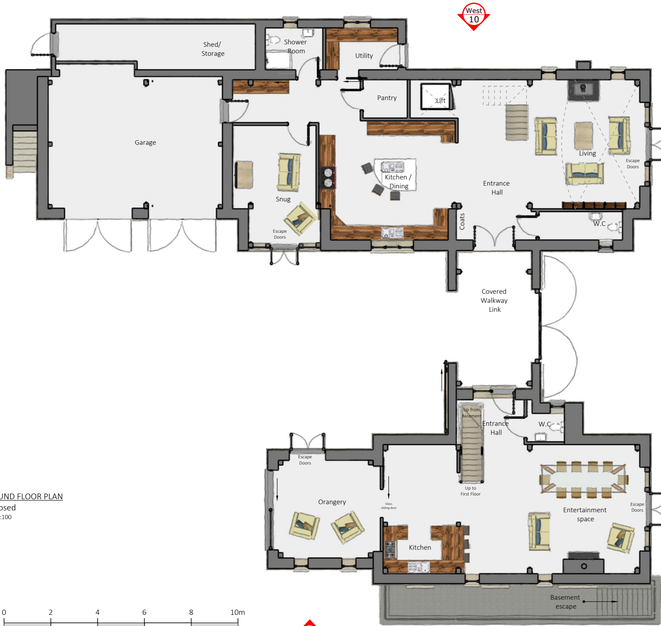
GROUND FLOOR PLAN Proposed Scale 1:100