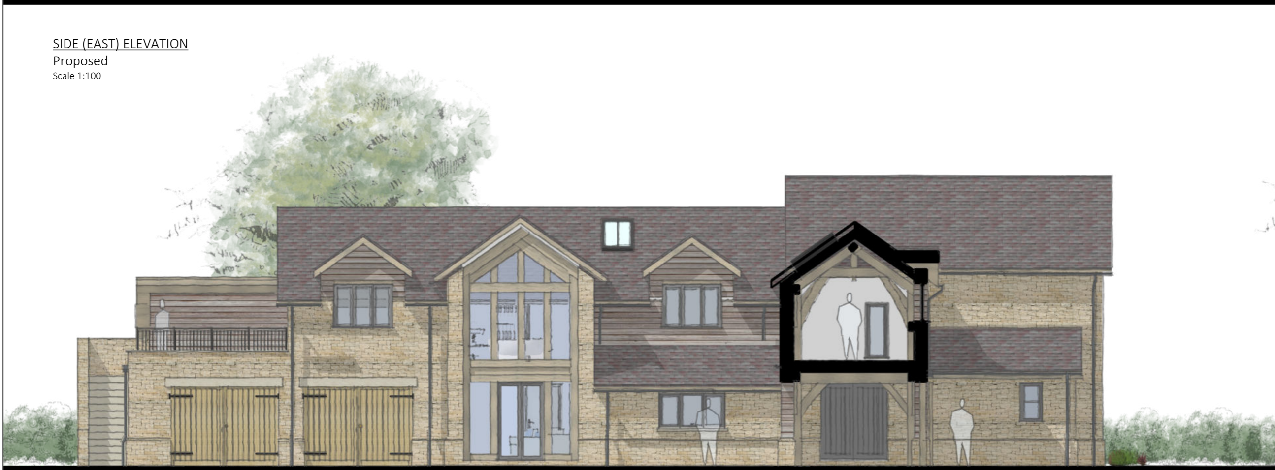
SIDE (EAST) ELEVATION (COURTYARD VIEW) Proposed Scale 1:100