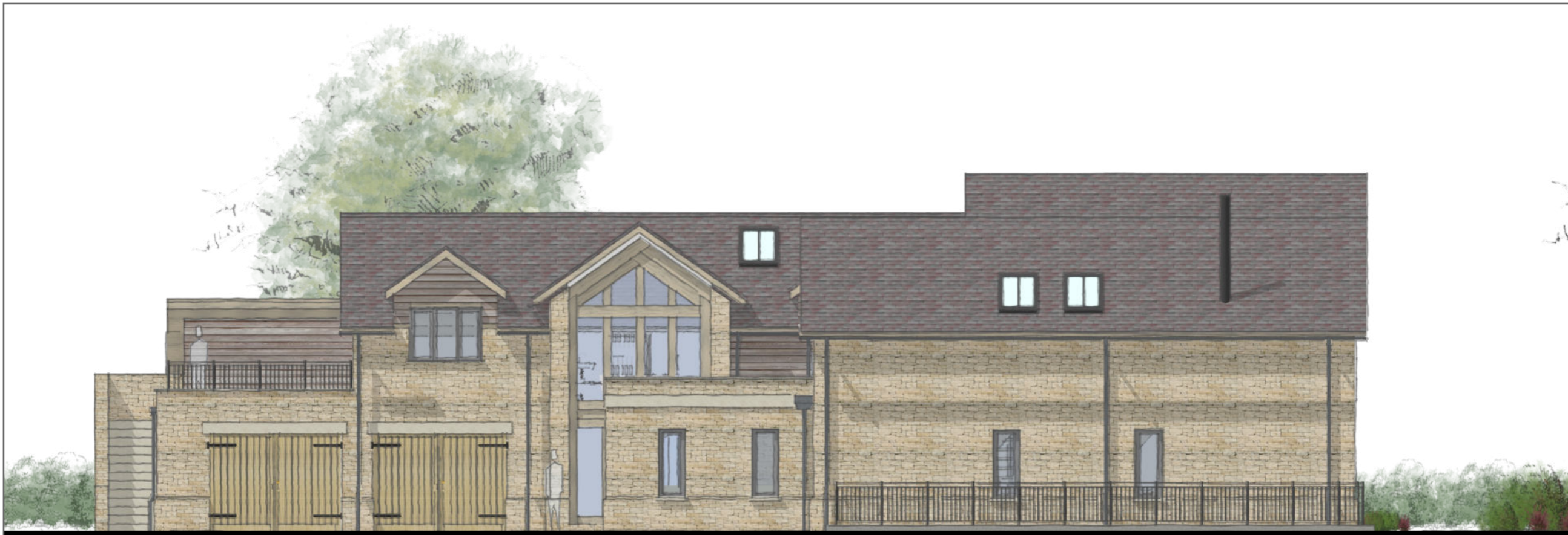
SIDE (EAST) ELEVATION Proposed Scale 1:100