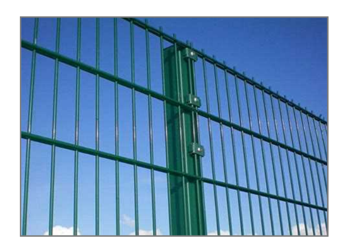
1800mm green Twin-wire weld mesh with native hedge growing through