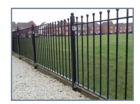
900mm high ball-topped railings with matching gate