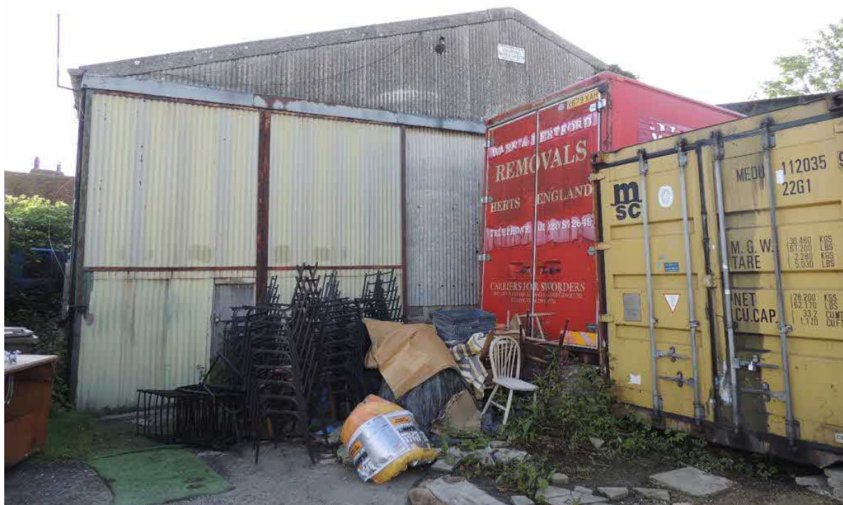
Photo 1: South-western elevation. The proposal is to demolish and replace with smaller light industrial units

As part of a planning application involving a modern barn at Lovecotes Farm, Chickney Road, Henham, Bishops Stortford, Hertfordshire CM22 6BH, a site visit was conducted on 26 th May 2022 to determine whether the site had the potential to be occupied by protected species, which would be affected if any proposed development were to go ahead.