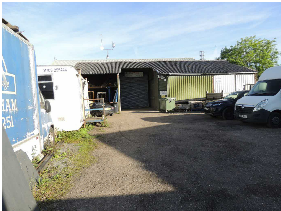
Photo 11: Looking north-westwards. Note lack of suitability for reptiles