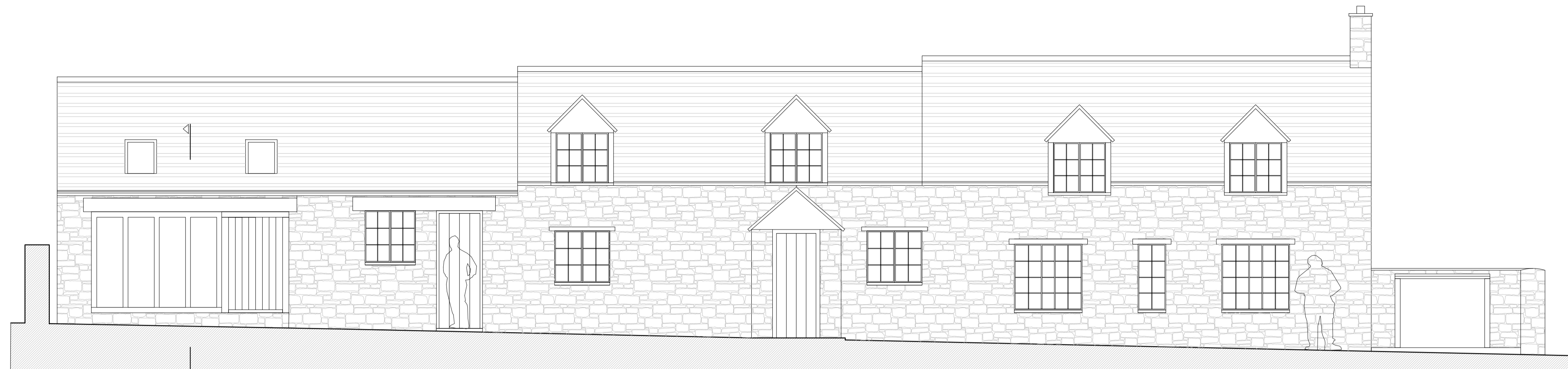
EXISTING SOUTH ELEVATION 1:50