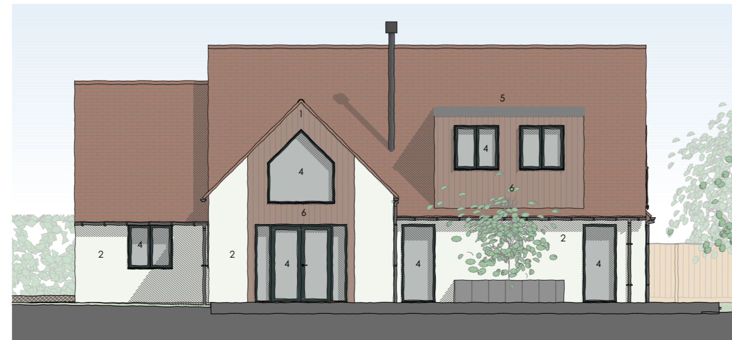
E-04 Elevation 1:100