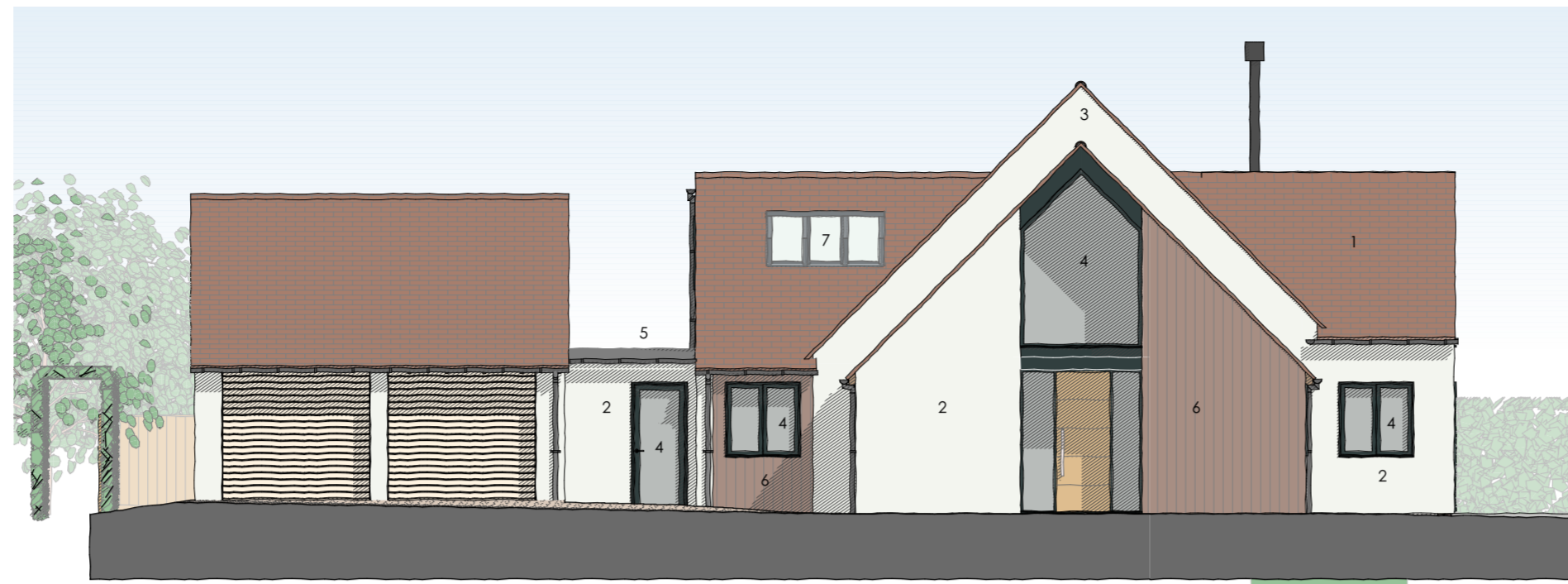
E-01 Elevation 1:100