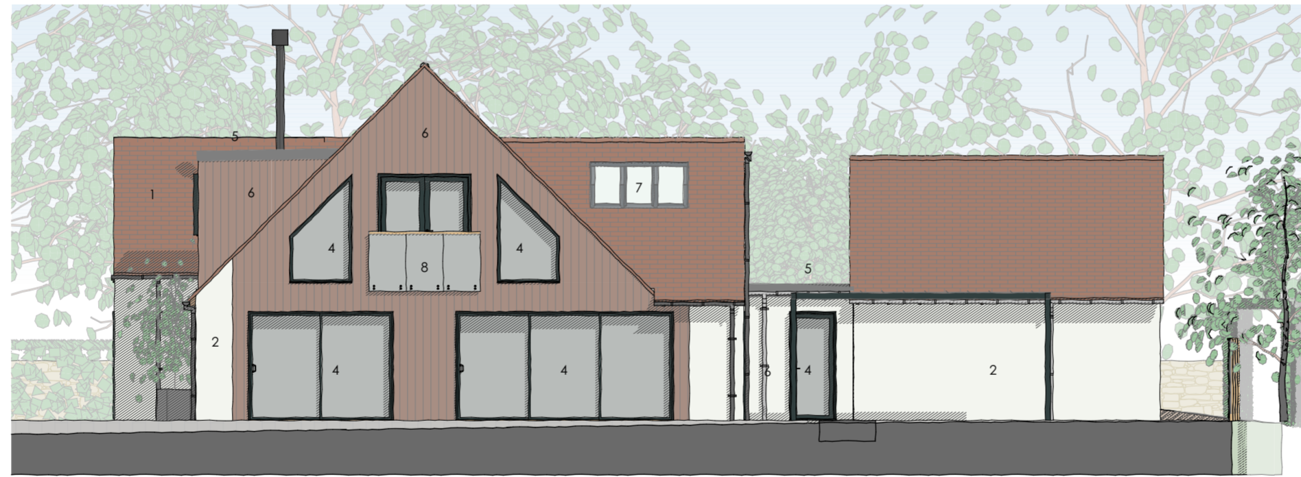
E-03 Elevation 1:100