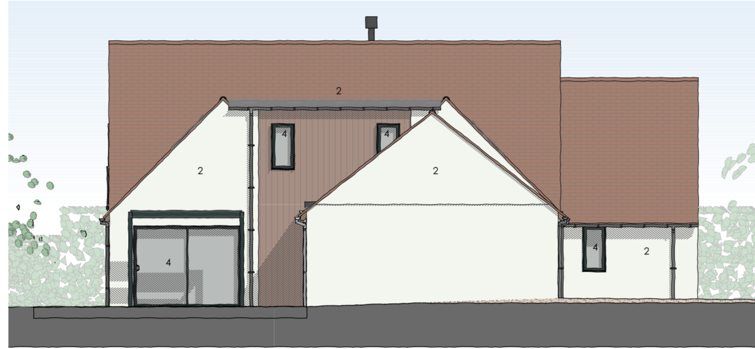
E-02 Elevation 1:100