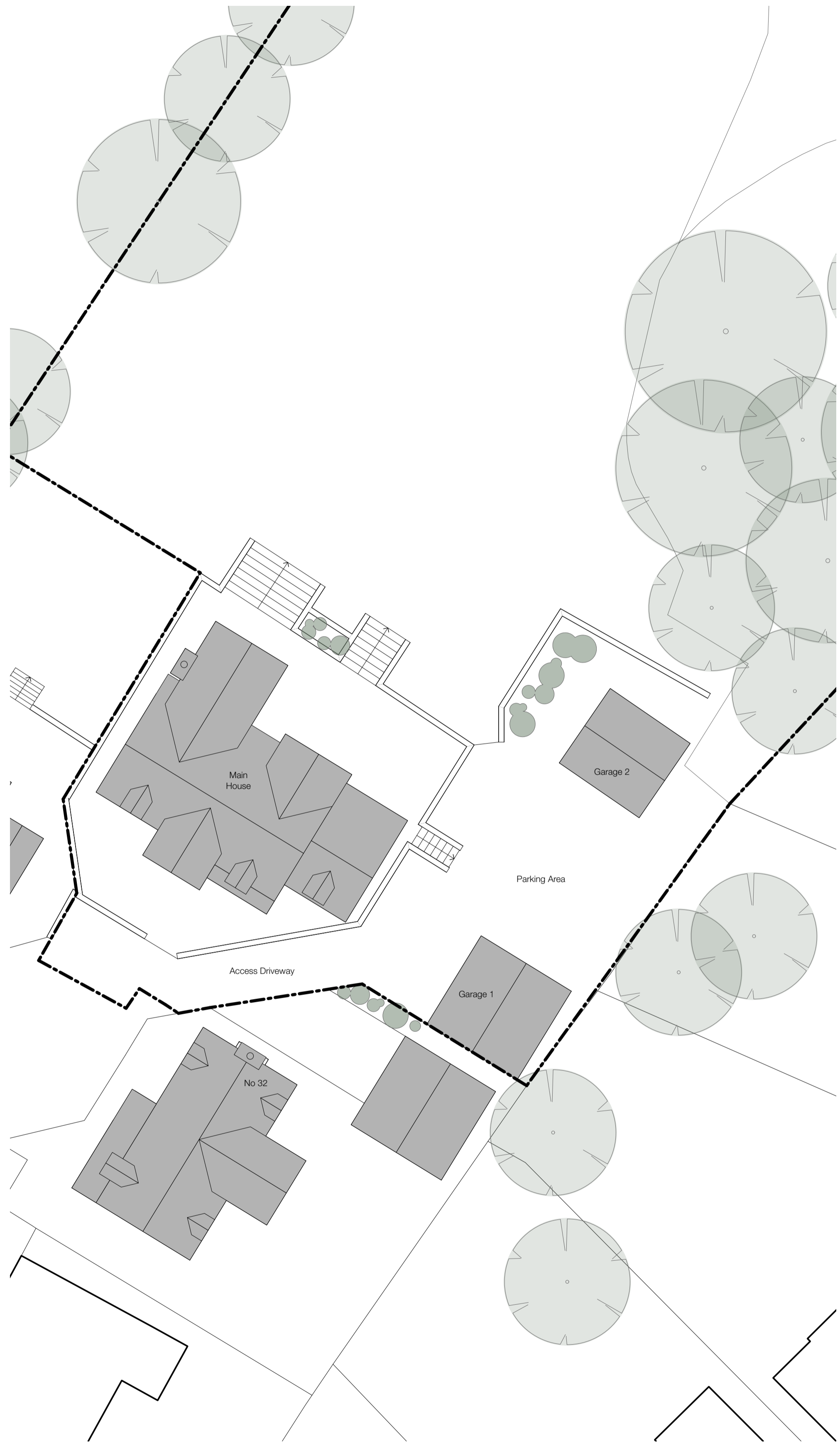
Existing Block Plan Scale 1:200