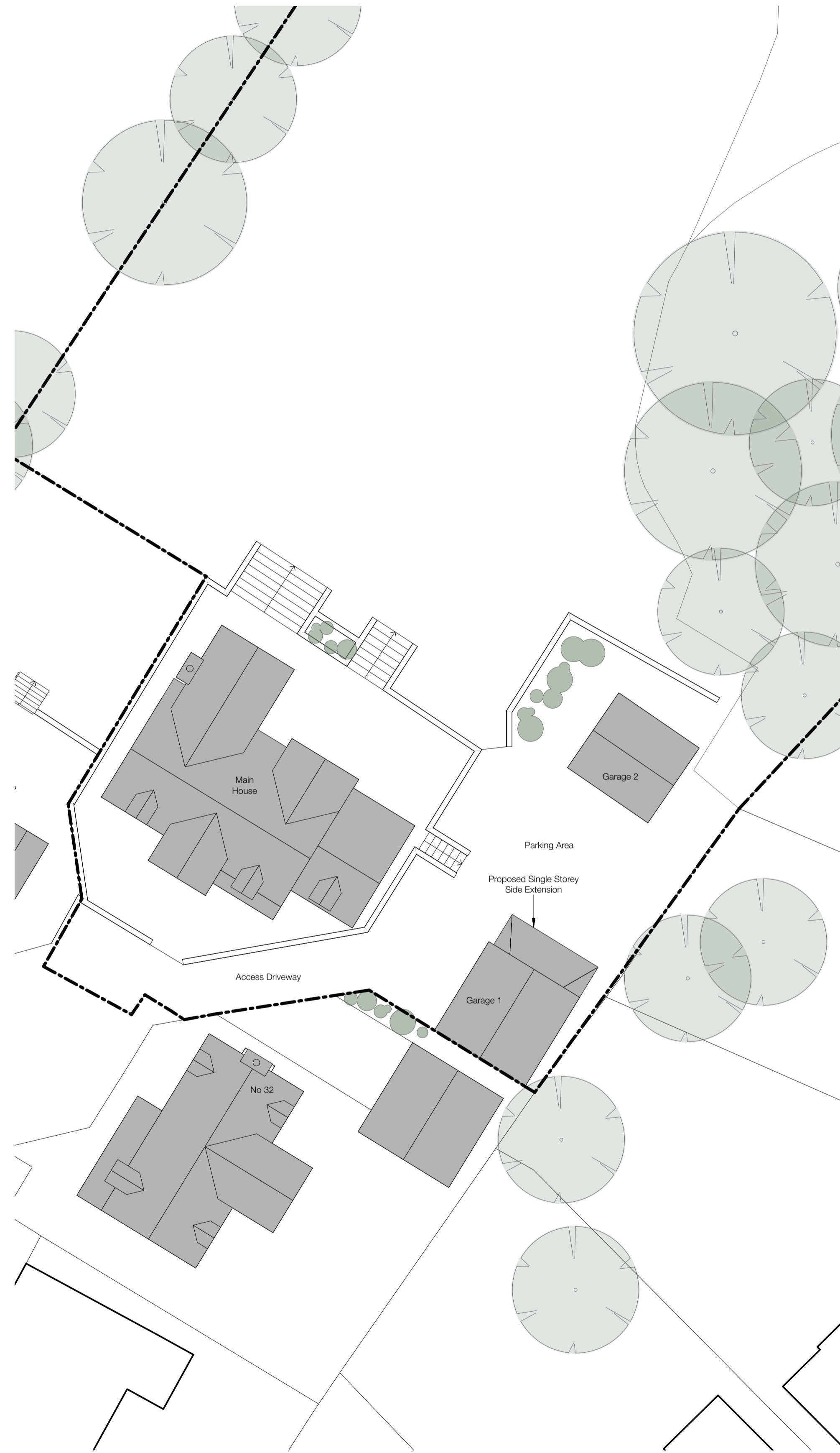
Proposed Block Plan Scale 1:200