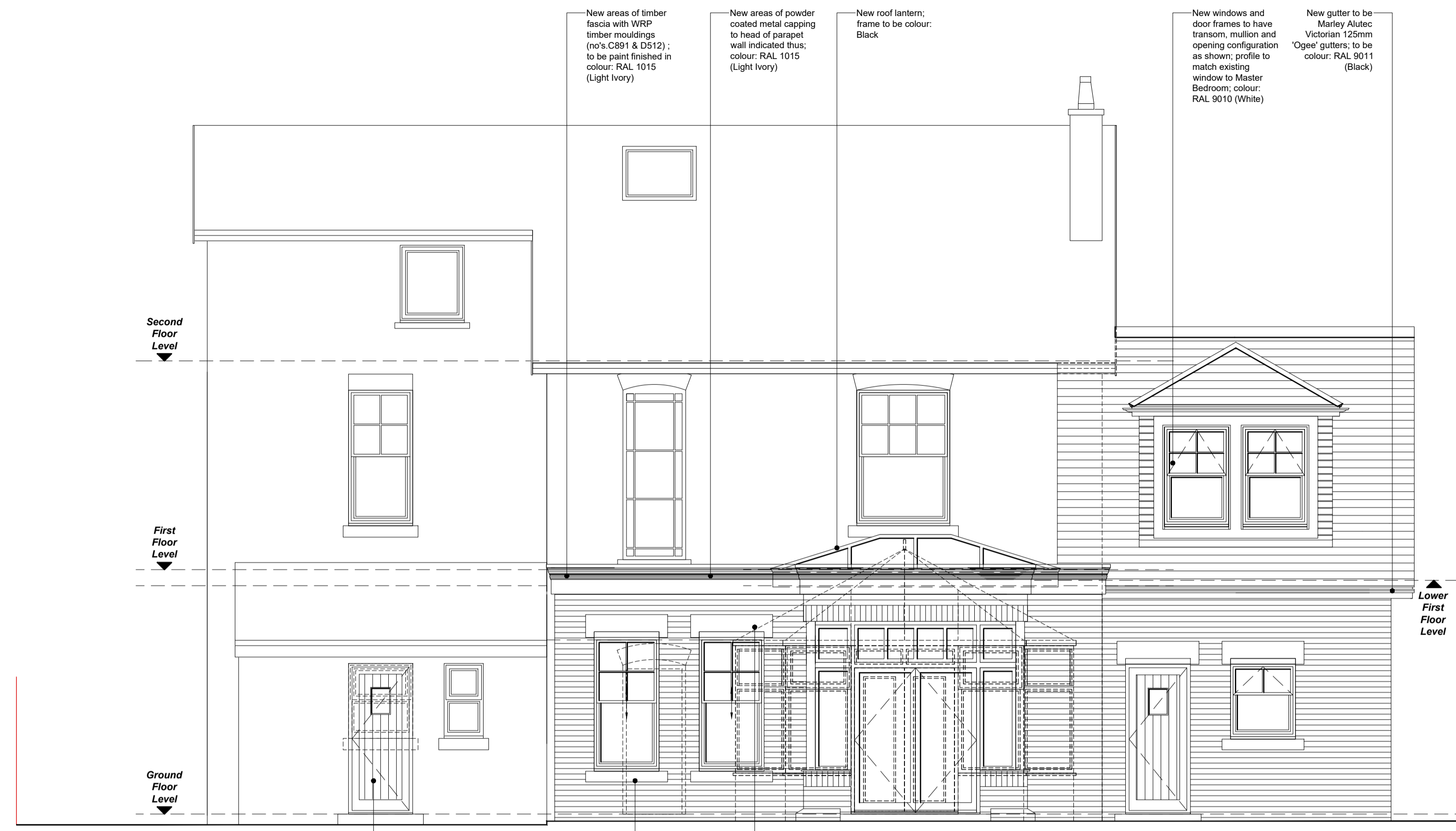
PROPOSED REAR (NORTH EASTERN) ELEVATION