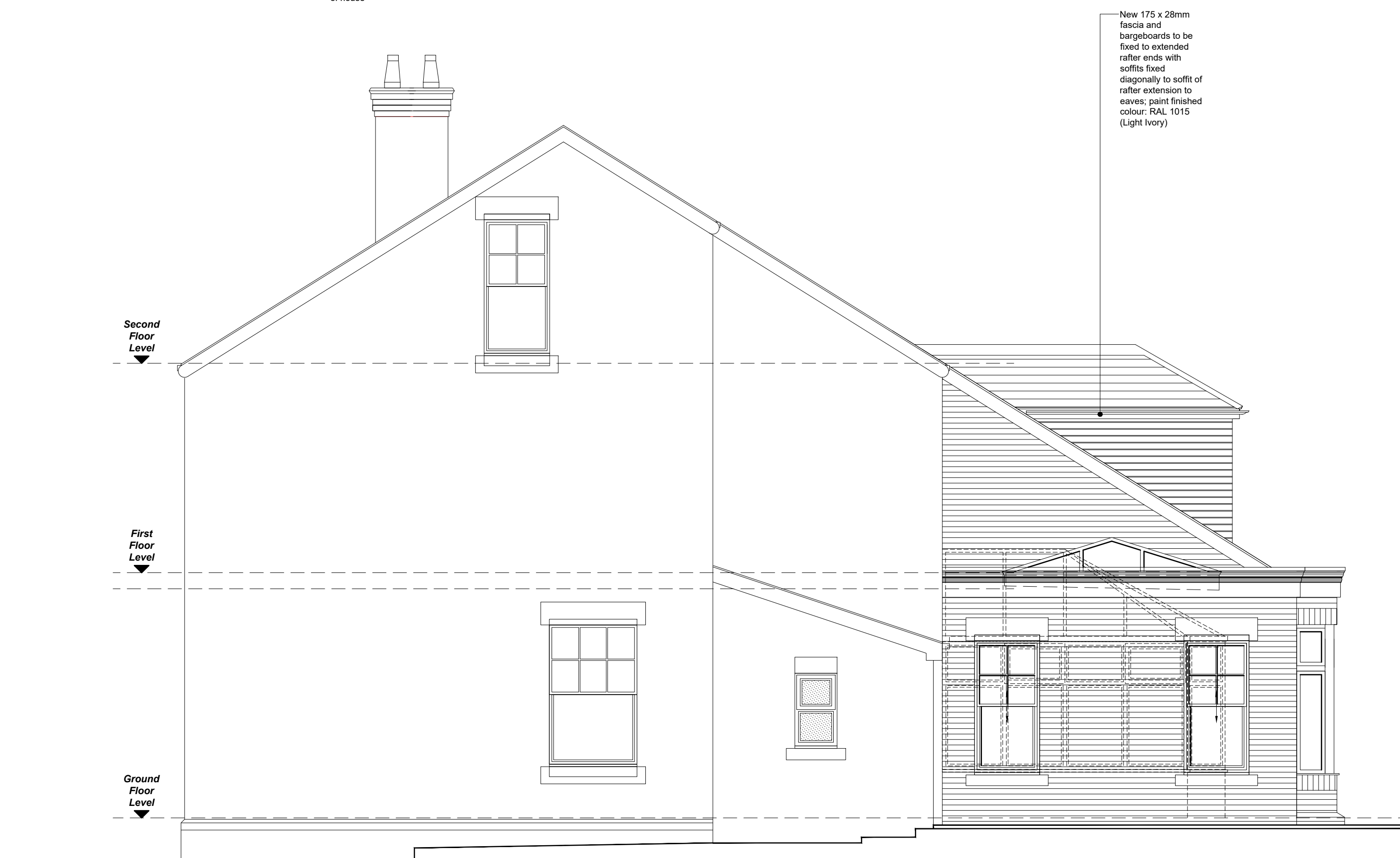
PROPOSED SIDE (SOUTH EASTERN) ELEVATION