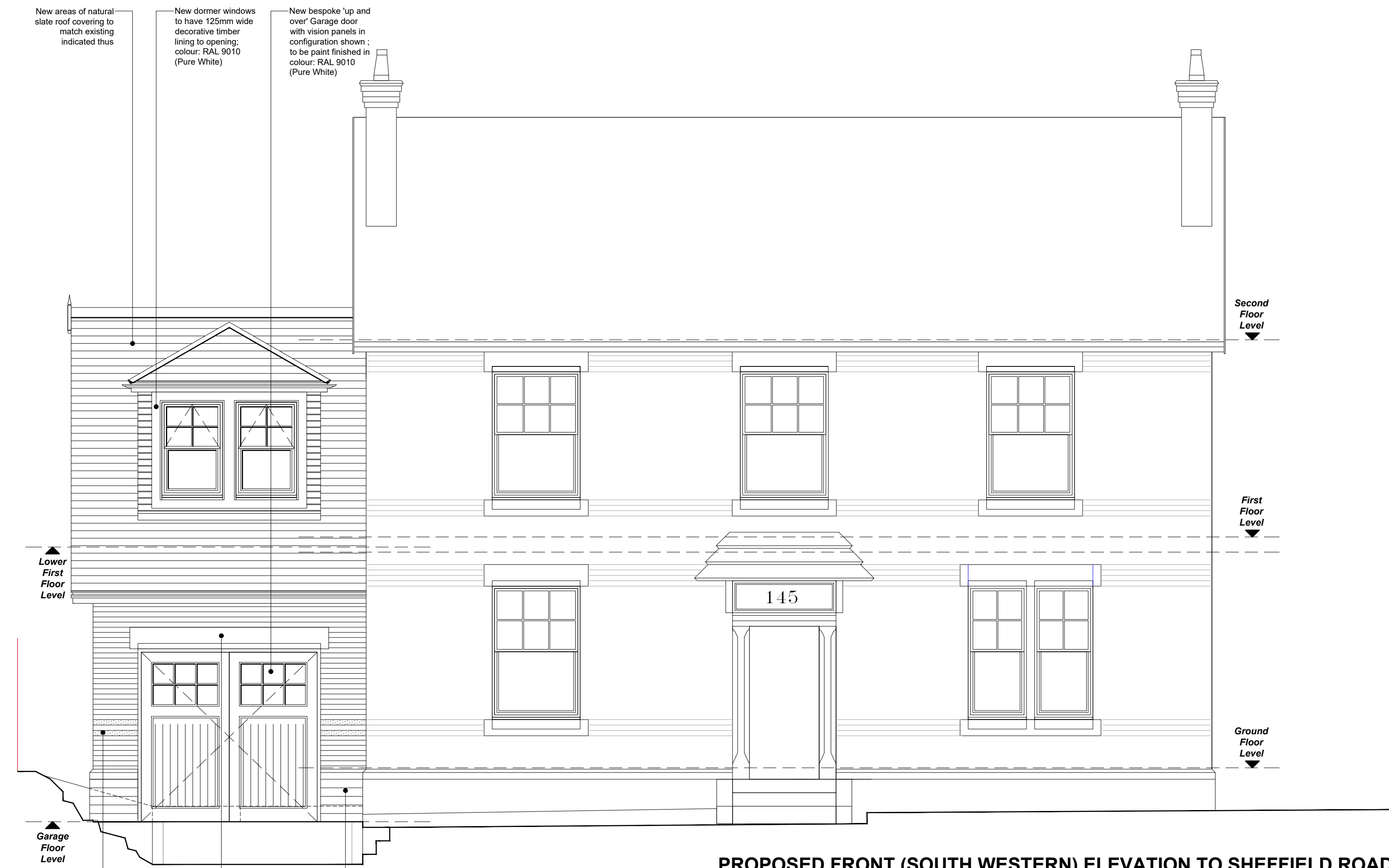
PROPOSED FRONT (SOUTH WESTERN) ELEVATION TO SHEFFIELD ROAD