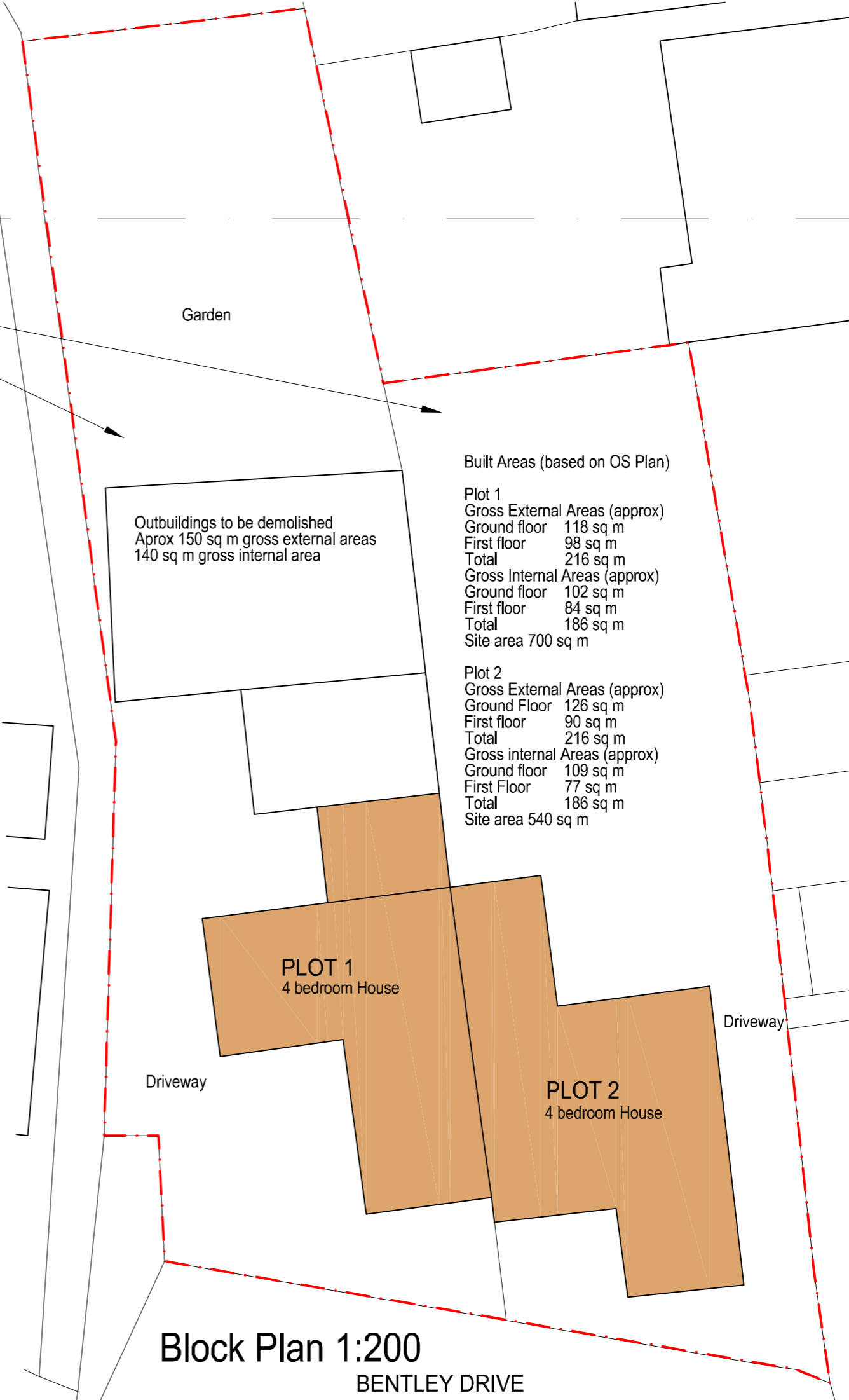
Block Plan 1:200