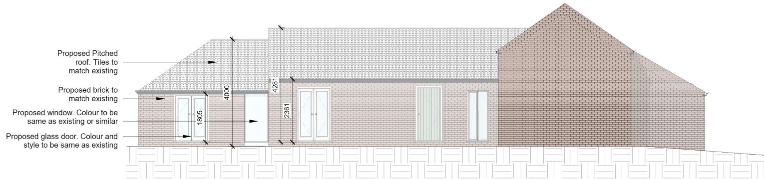
East 1 : 100

Do not scale from drawing. AM2 Ltd accept no responsibility for any dimensions obtained by measuring or scaling from this drawing and no reliance should be placed on such dimensions. If no dimension is given, it is the responsibility of the recipient to obtain the dimension specifically from the author or by site measurement. The sizing of all structural and service elements must always be checked against the relevant engineer's drawings. No reliance should be placed upon sizing information shown on this drawing.