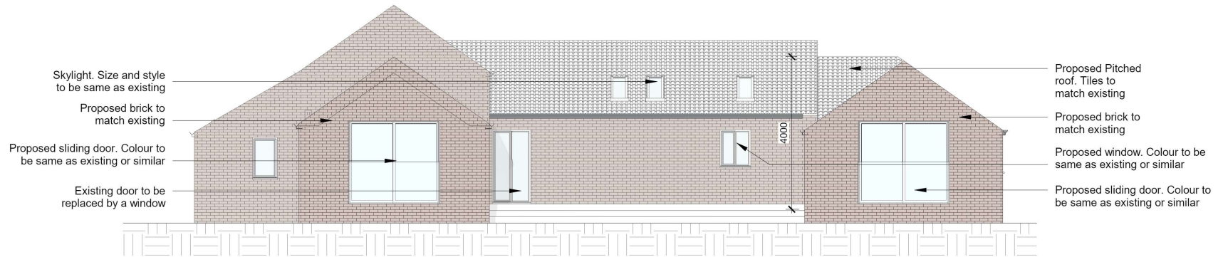
West 1 : 100

Do not scale from drawing. AM2 Ltd accept no responsibility for any dimensions obtained by measuring or scaling from this drawing and no reliance should be placed on such dimensions. If no dimension is given, it is the responsibility of the recipient to obtain the dimension specifically from the author or by site measurement. The sizing of all structural and service elements must always be checked against the relevant engineer's drawings. No reliance should be placed upon sizing information shown on this drawing.