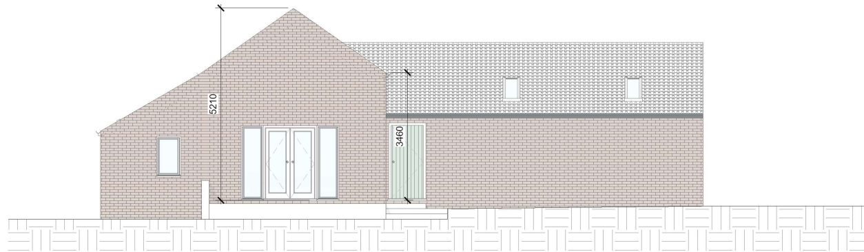
West 1 : 100

Do not scale from drawing. AM2 Ltd accept no responsibility for any dimensions obtained by measuring or scaling from this drawing and no reliance should be placed on such dimensions. If no dimension is given, it is the responsibility of the recipient to obtain the dimension specifically from the author or by site measurement. The sizing of all structural and service elements must always be checked against the relevant engineer's drawings. No reliance should be placed upon sizing information shown on this drawing.