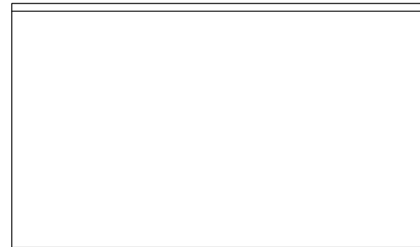
2 ROOF PLAN SCALE 1:100

KLEDESIGN ARCHITECTURE | PLANNING | VISUALISATIONS