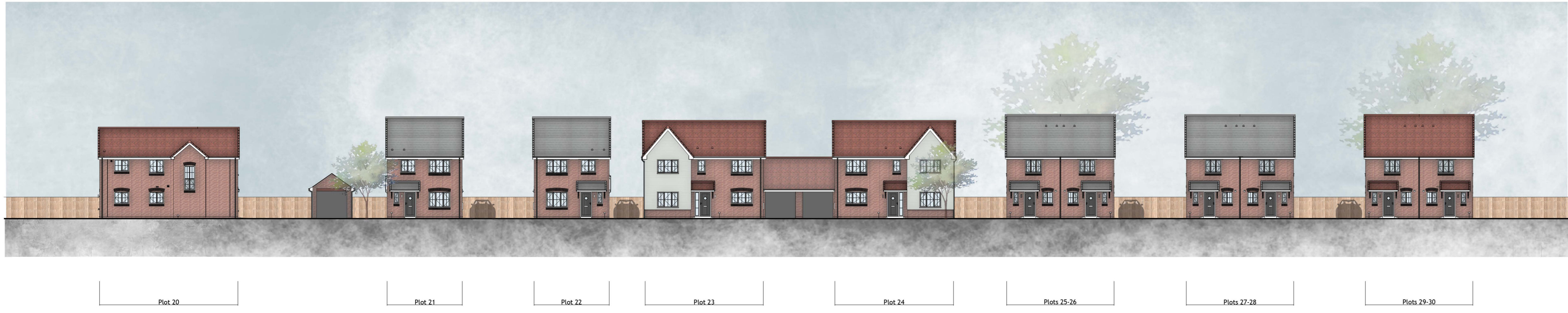
Street Scene A-A