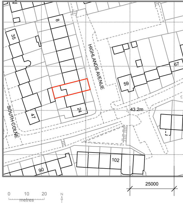
1 Location Map Scale: 1:1250