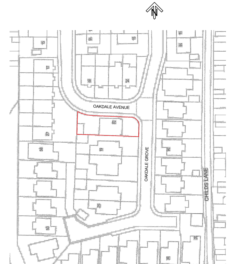
LOCATION PLAN 1:1000