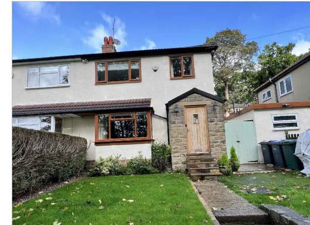
Photo 01 Showing South Facing Elevation