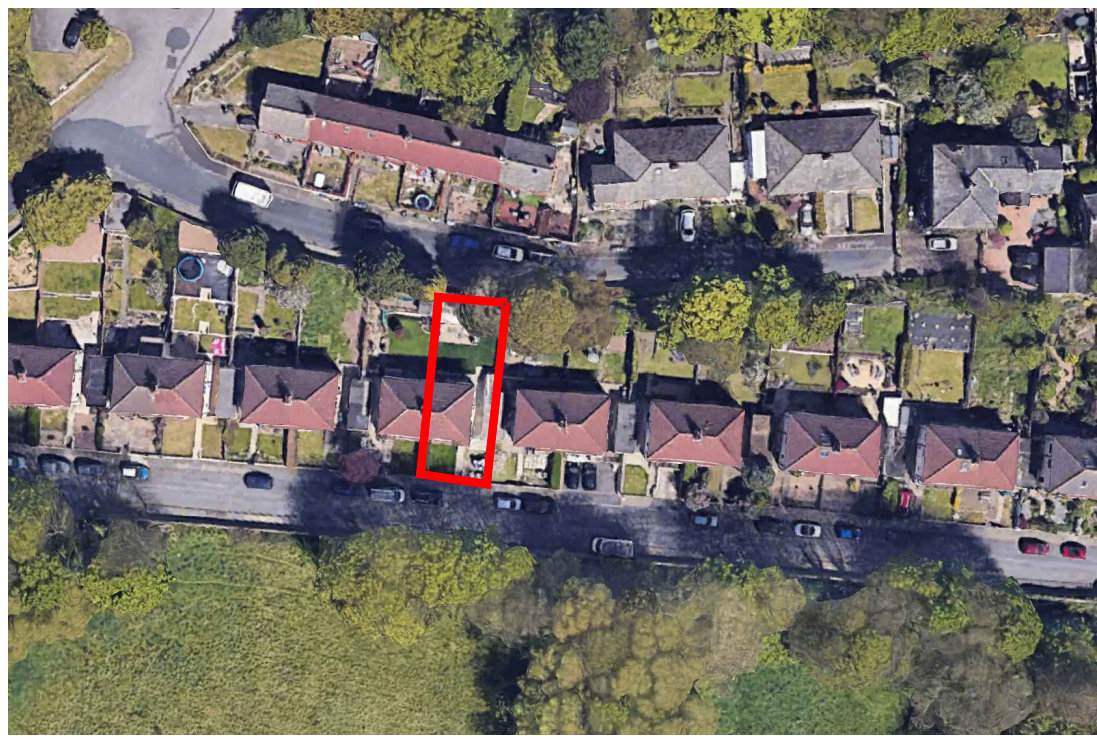
Aerial Image Information taken from 'Goggle Earth (Nov 2023)' Applicants site boundary edged in 'Red'.