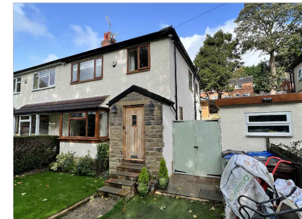
Photo 02 Showing South & East Facing Elevations