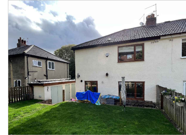
Photo 04 Showing North Facing Elevation