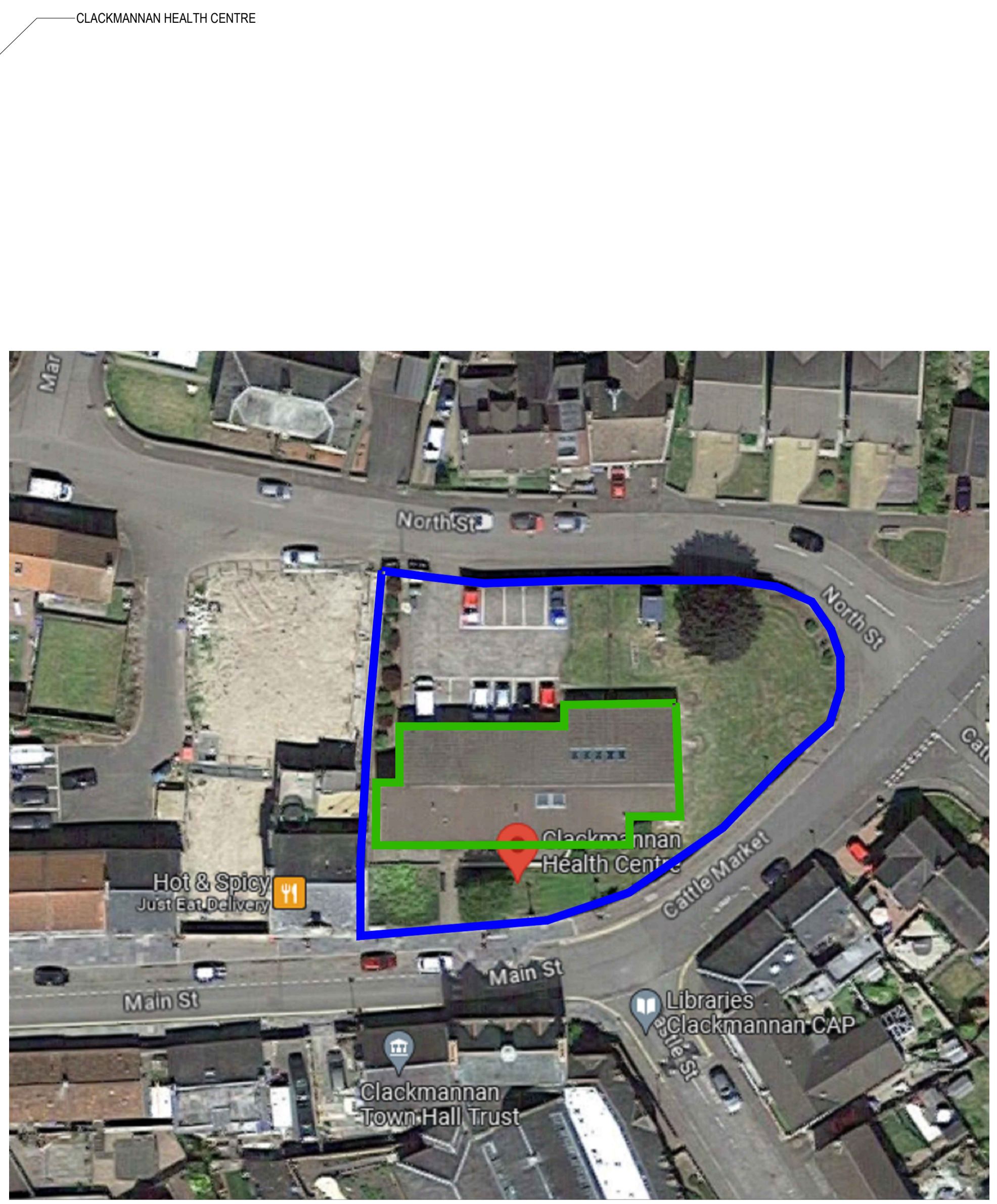
CLACKMANNAN HEALTH CENTRE SOLAR PANEL LOCATIONS