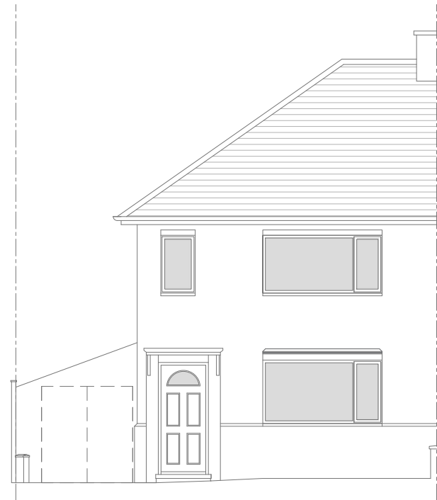
Front Elevation - Facing Northwest