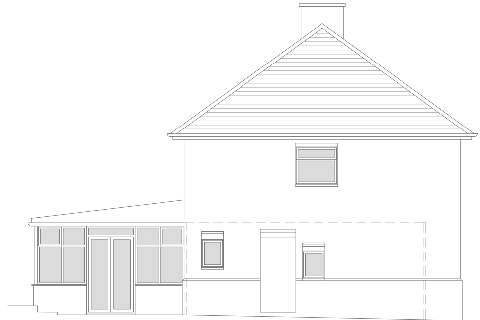
Side Elevation - Facing Northeast