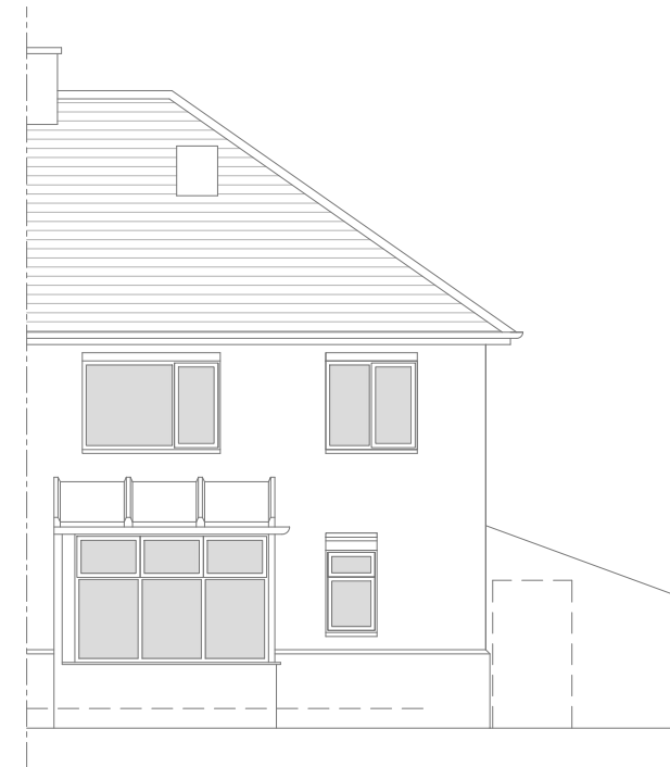
Rear Elevation - Facing Southeast