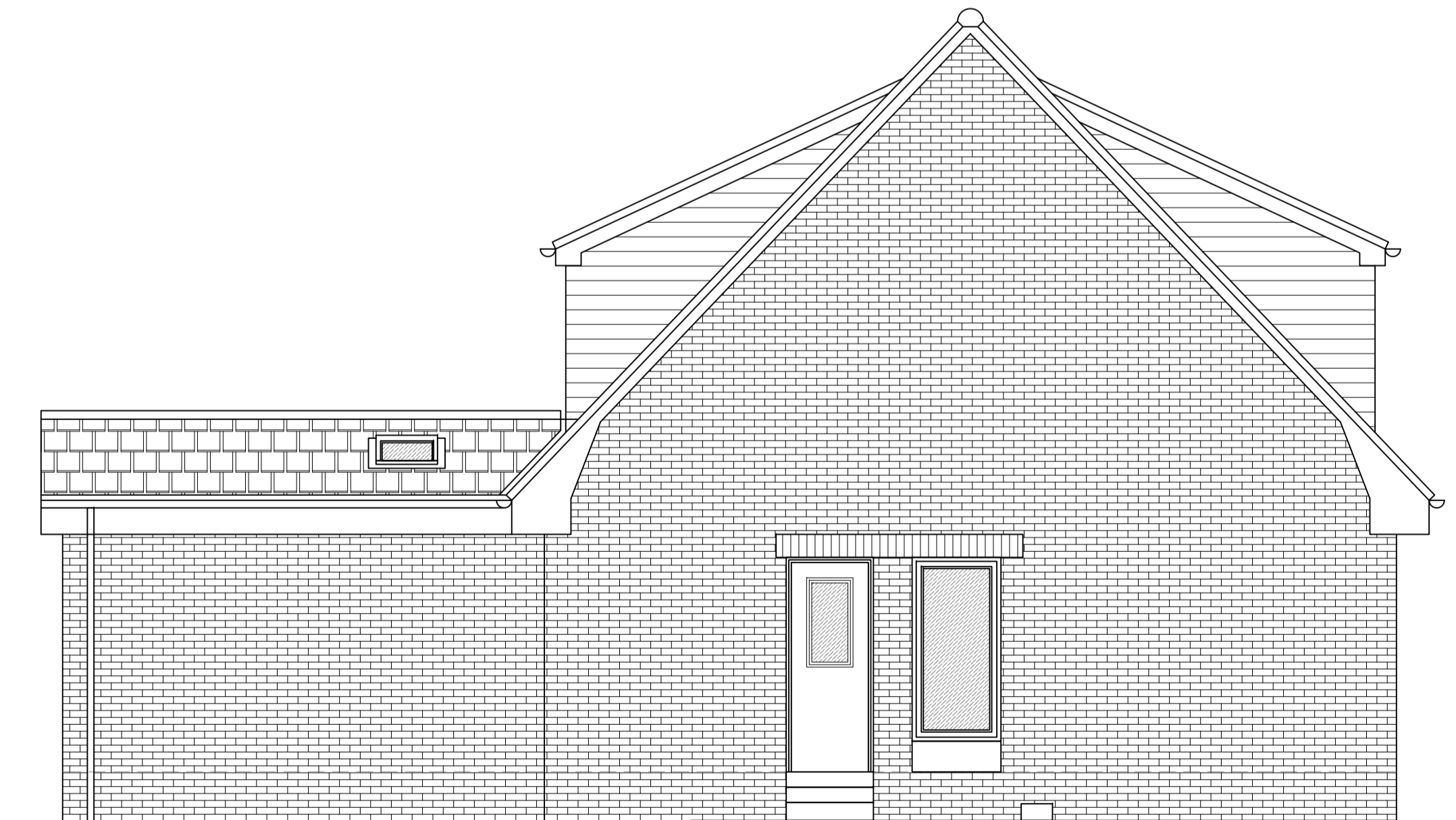
north east elevation