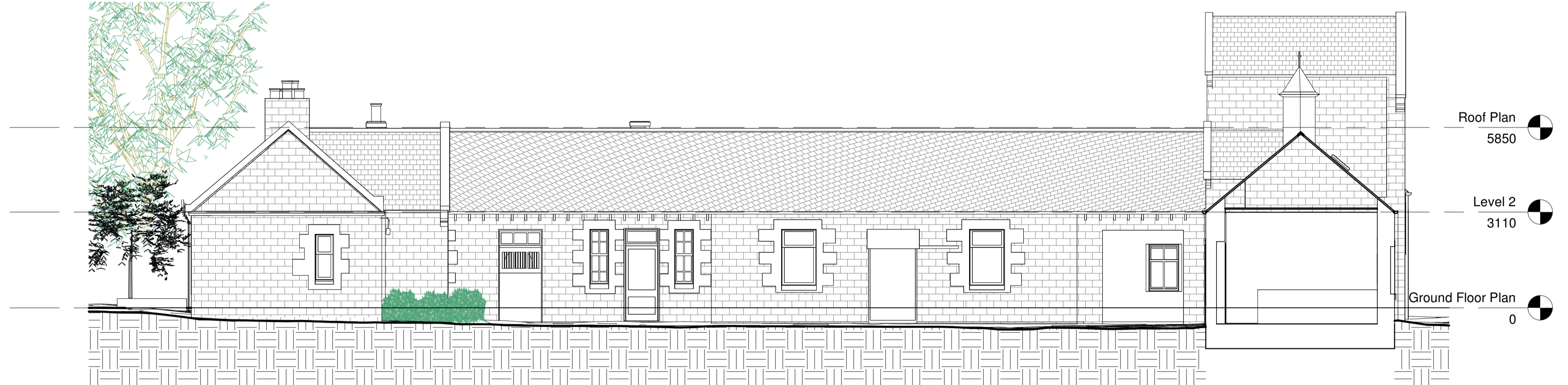
3 Courtyard- South Elevation 1 : 100