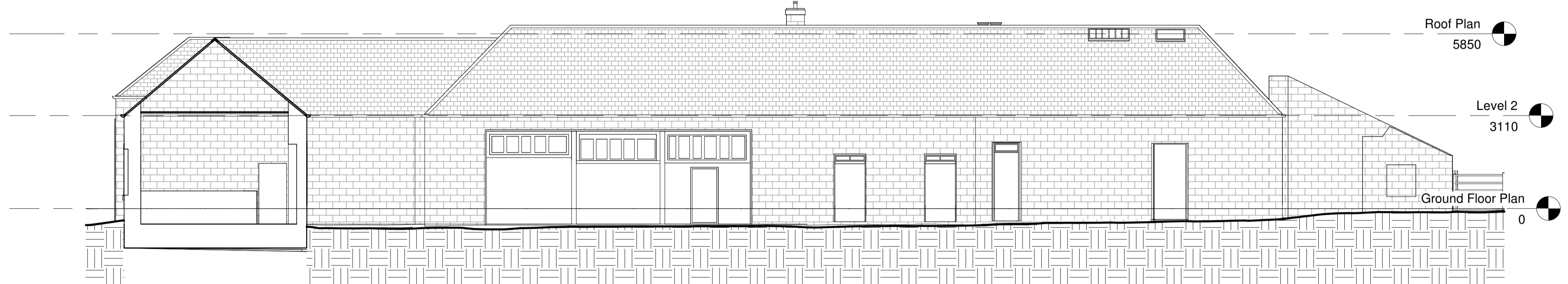
2 Courtyard- North Elevation 1 : 100