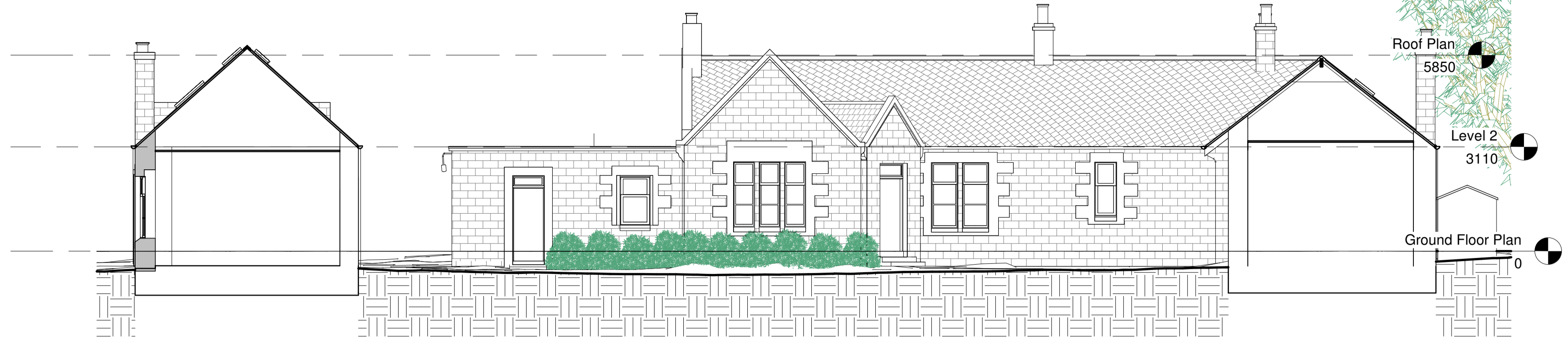
1 Courtyard- East Elevation 1 : 100