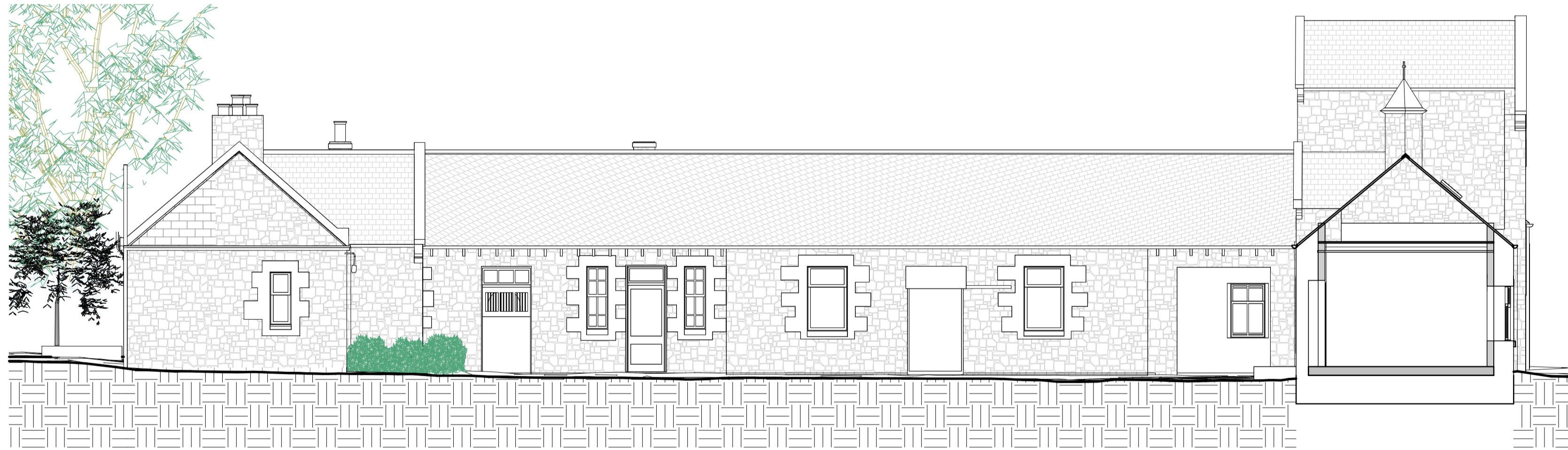
3 Courtyard- South Elevation 1 : 100 (NO CHANGE VISIBLE TO THIS ELEVATION)

new conservation style rooflight Slate roof to match existing new extension clad in tongue and groove Siberian timber cladding with SiOO.X factory coating to give a uniform weathered appearance new half glazed door New opening with stone cill and lintol to match existing, and timber sash and case double glazed window infill wall clad in tongue and groove Siberian timber cladding with SiOO.X factory coating to give a uniform weathered appearance cill added to existing door opening to form window. New timber sash and case window installed