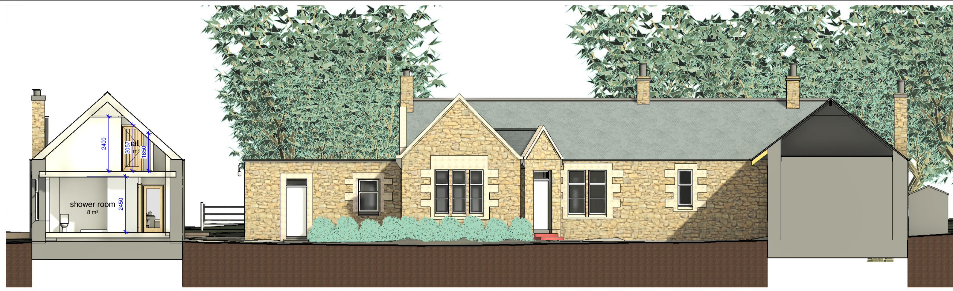
1 Courtyard- East Elevation 1 : 100