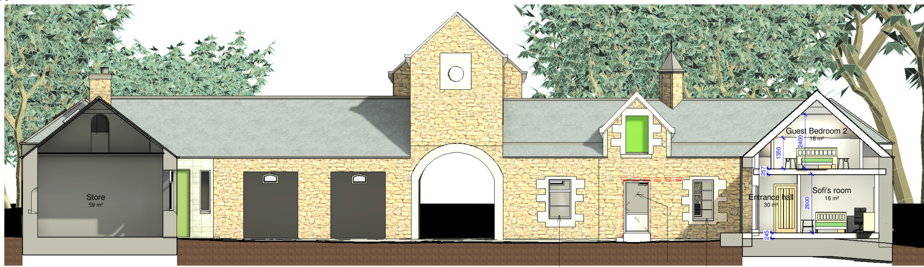
4 Courtyard- West Elevation 1 : 100

New timber half glazed door new double glazed timber window to match existing