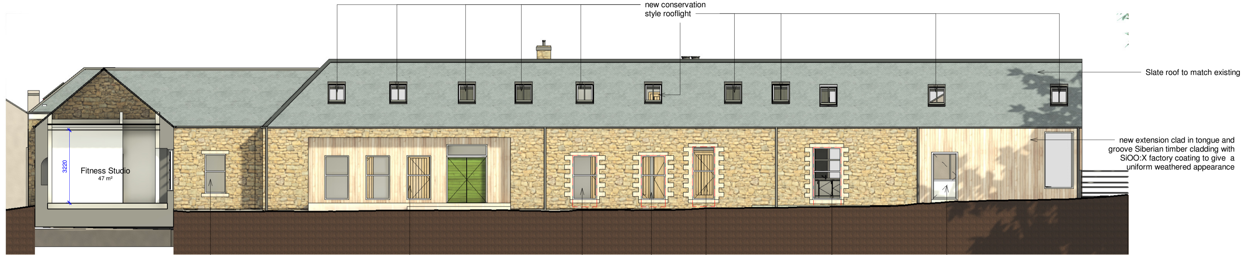
2 Courtyard- North Elevation 1 : 100

new conservation style rooflight Slate roof to match existing new extension clad in tongue and groove Siberian timber cladding with SiOO.X factory coating to give a uniform weathered appearance new half glazed door New opening with stone cill and lintol to match existing, and timber sash and case double glazed window infill wall clad in tongue and groove Siberian timber cladding with SiOO.X factory coating to give a uniform weathered appearance cill added to existing door opening to form window. New timber sash and case window installed