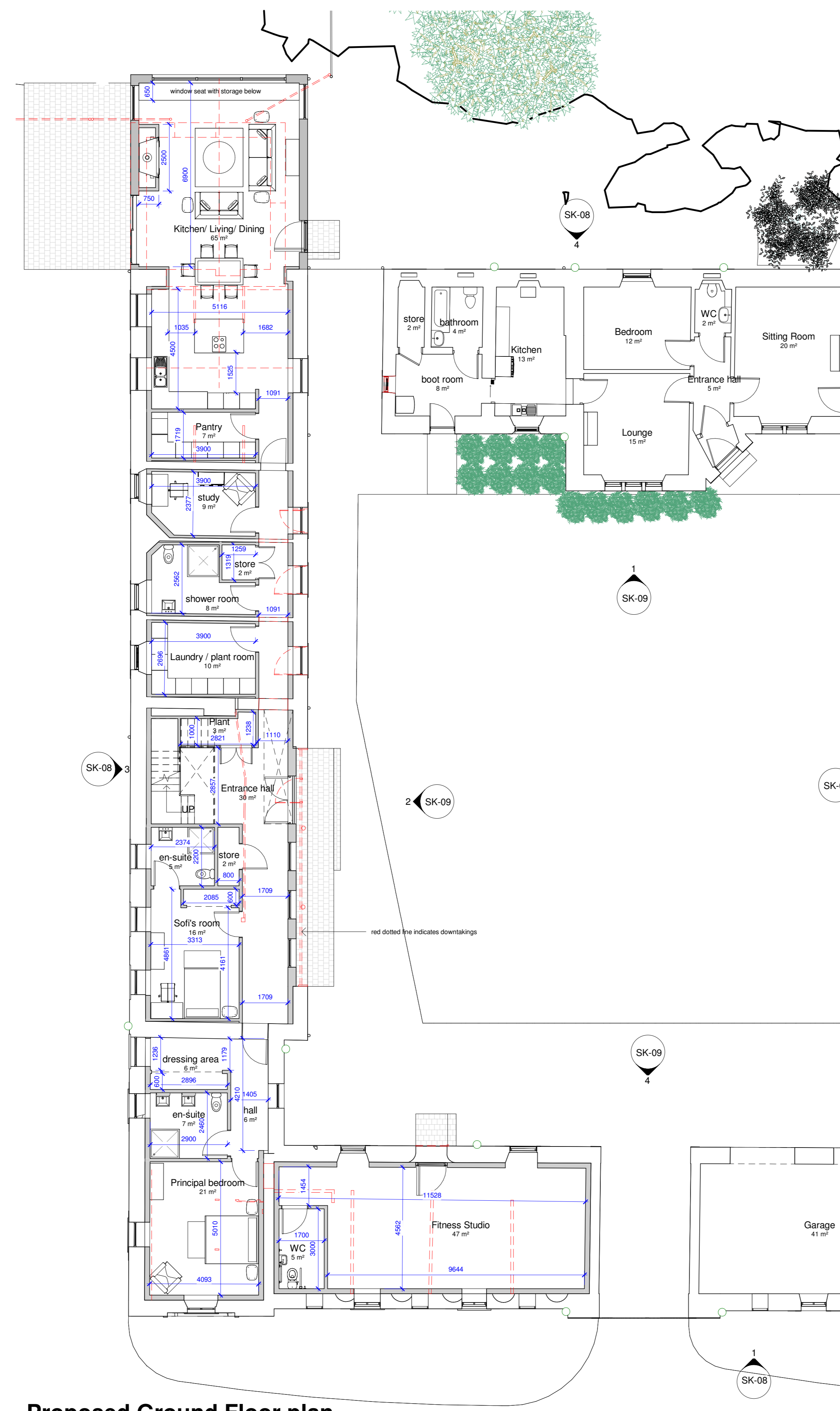
Proposed Ground Floor plan 1 : 100