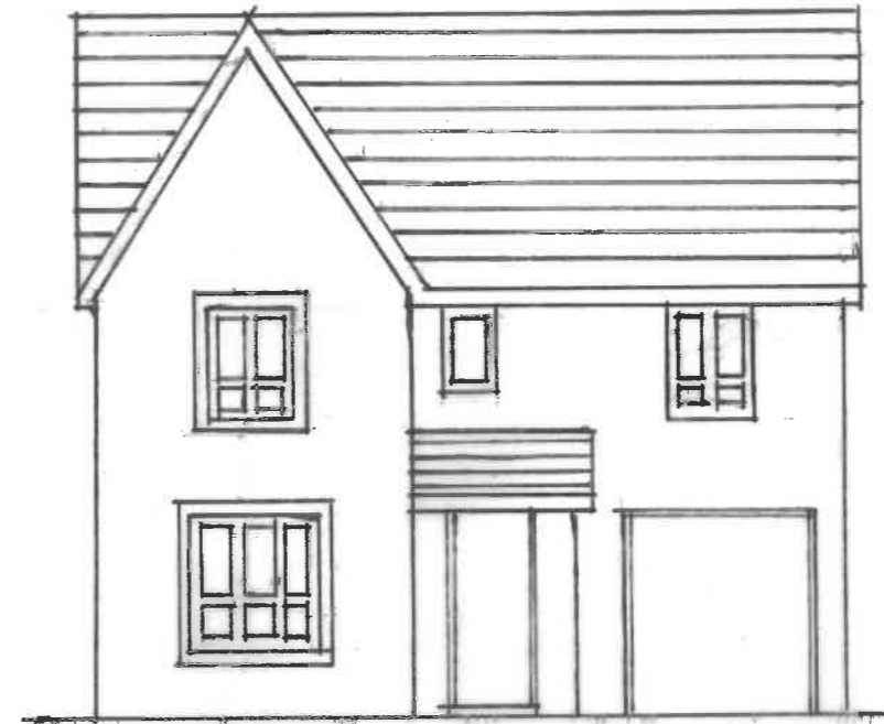
Front Elevation as Existing 1:100