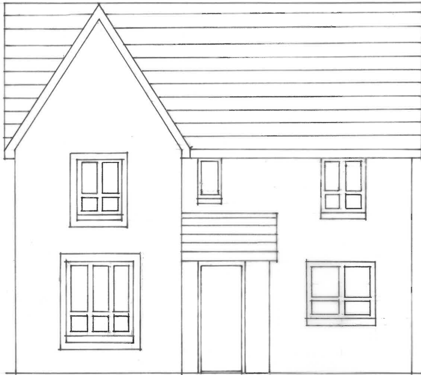
Front Elevation as Proposed 1:50