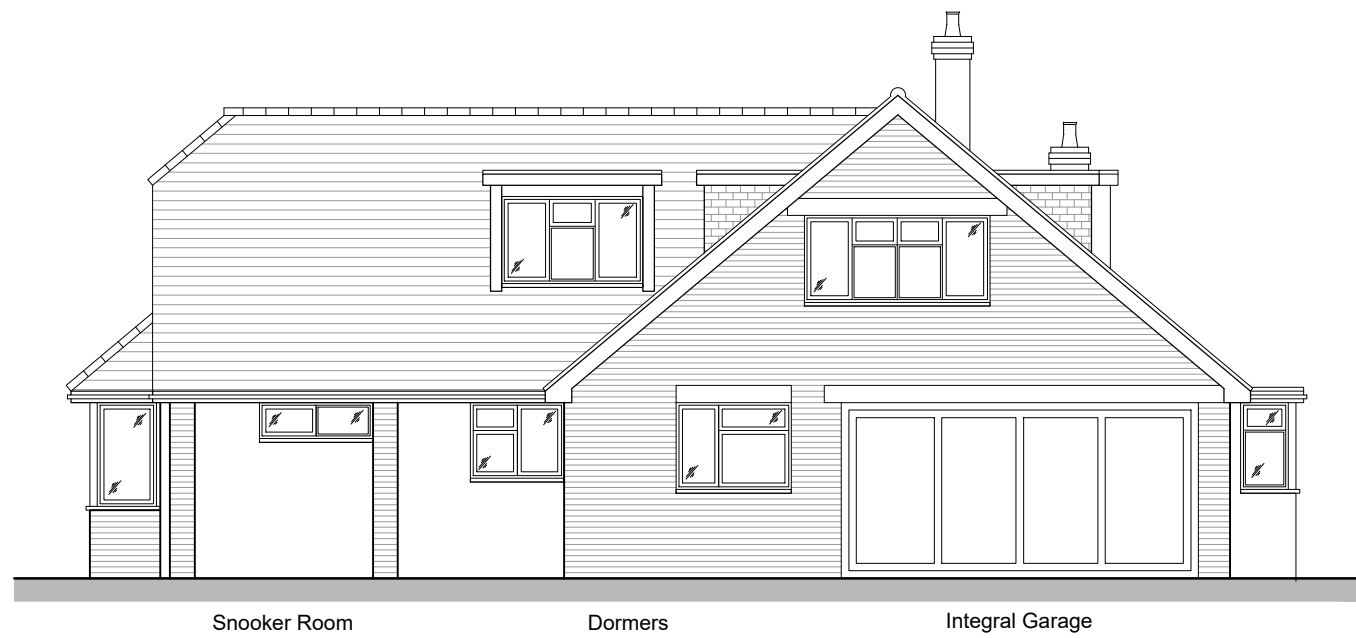
Existing South-east Elevation Scale 1:100