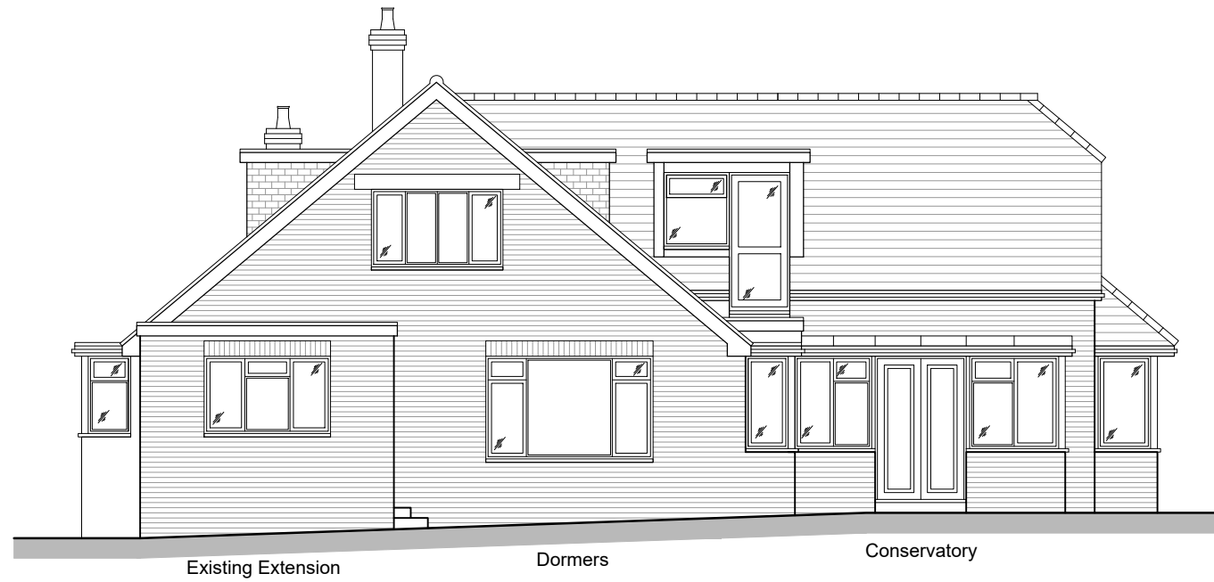
Existing North-west Elevation Scale 1:100