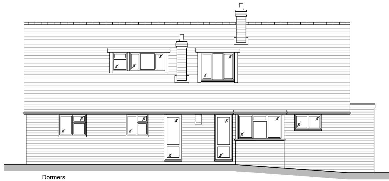
Existing North-east Elevation Scale 1:100