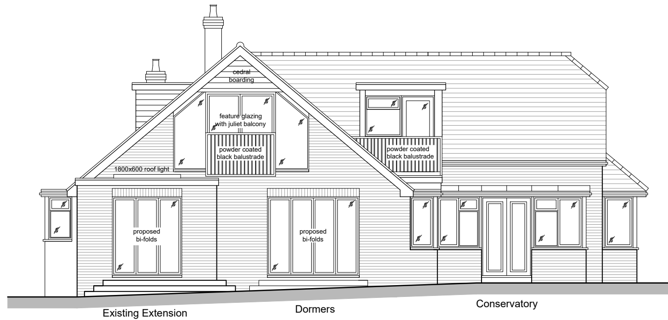
Proposed North-west Elevation Scale 1:100