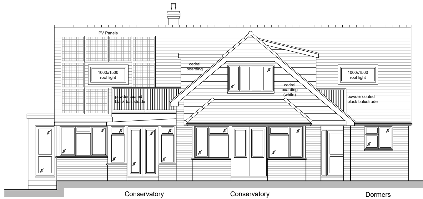
Proposed South-west Elevation Scale 1:100