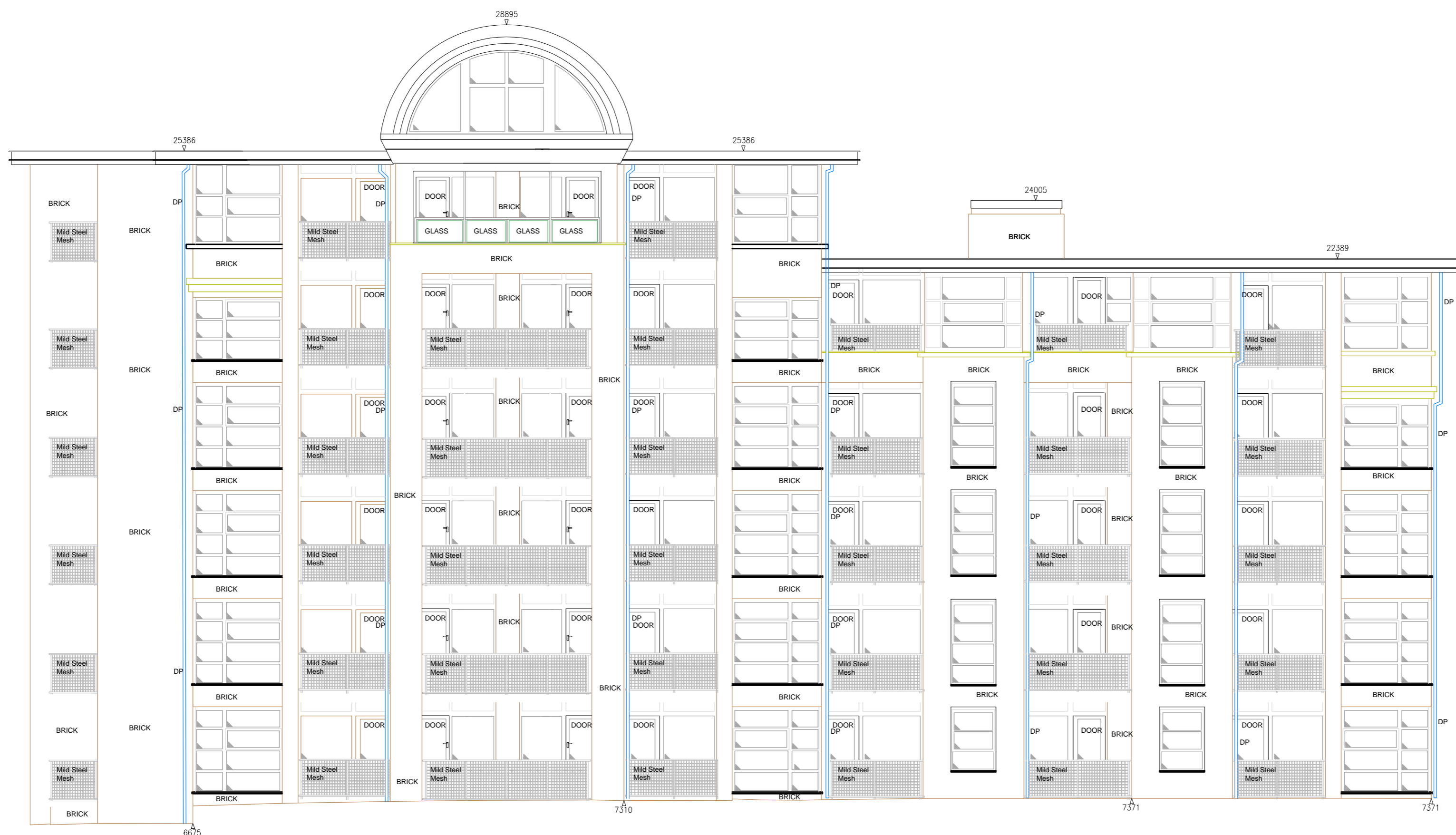
West Elevation as Existing