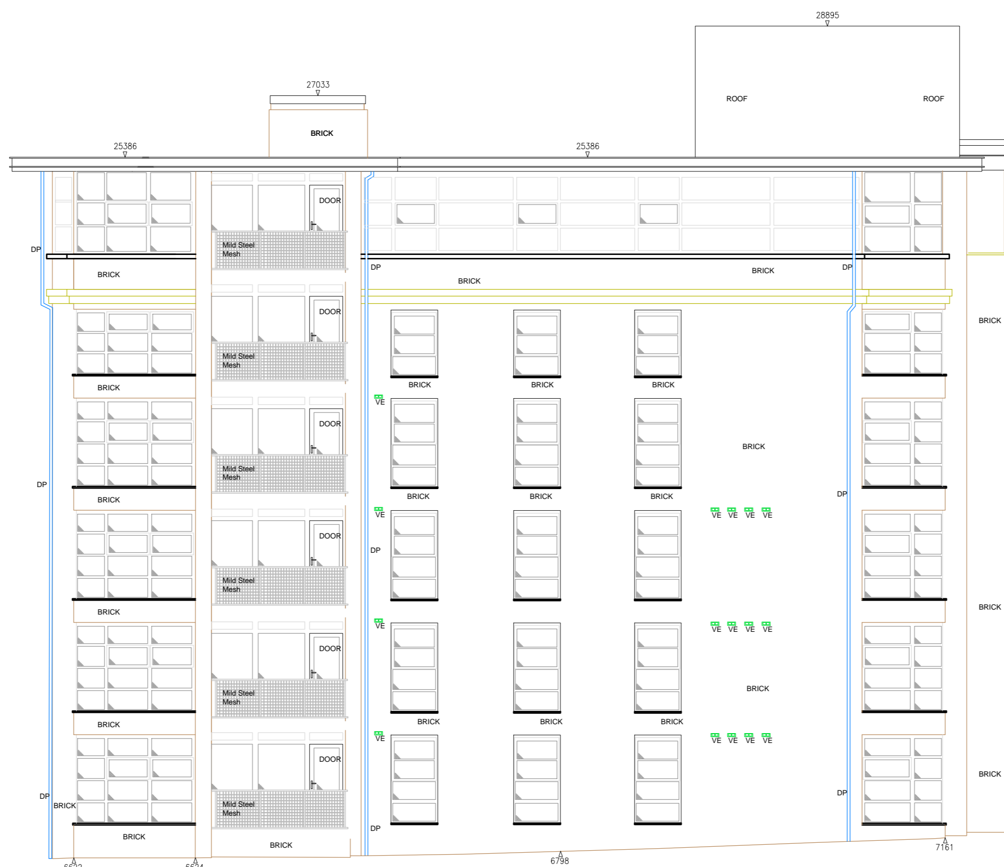
North Elevation as Existing