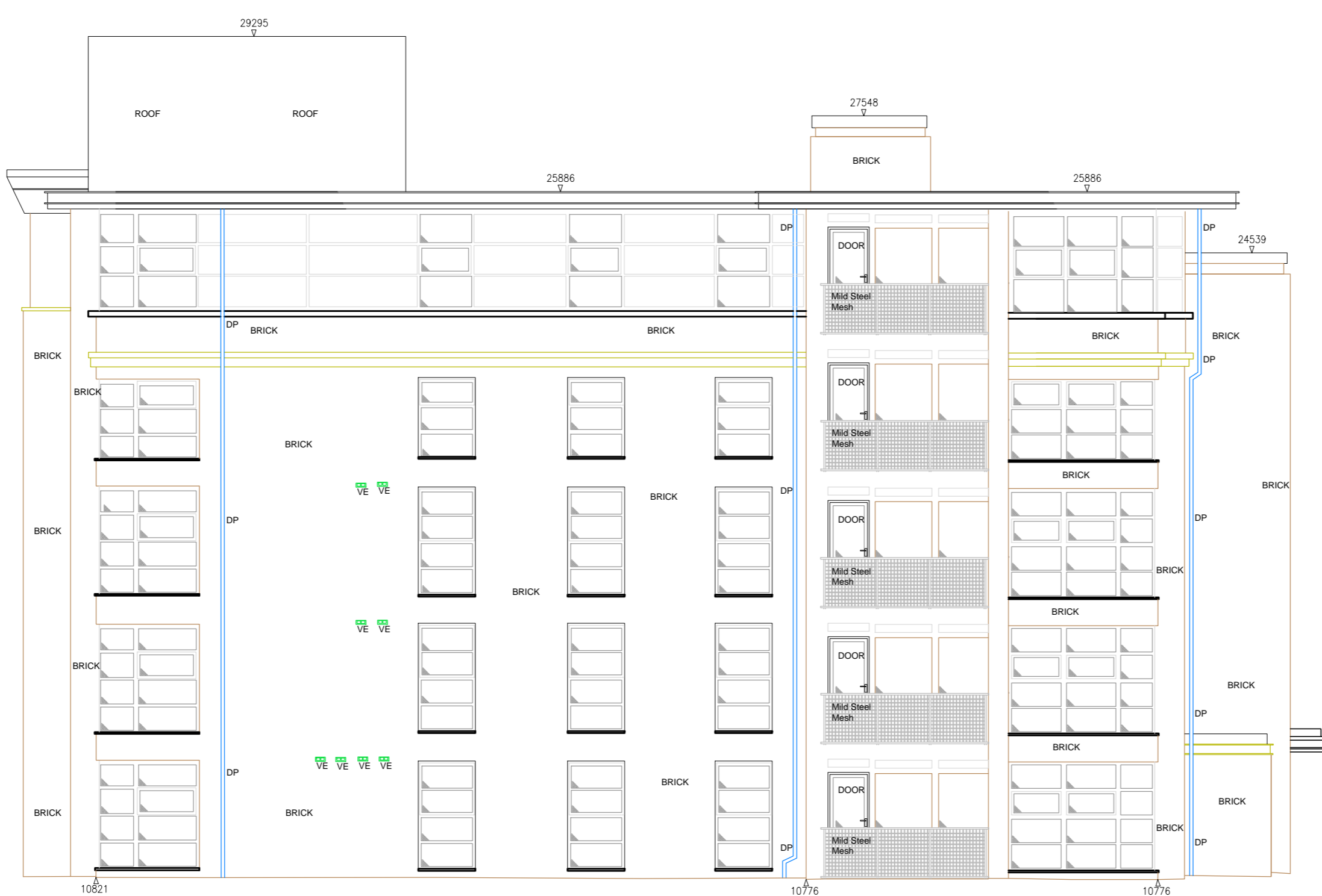
South Elevation as Existing