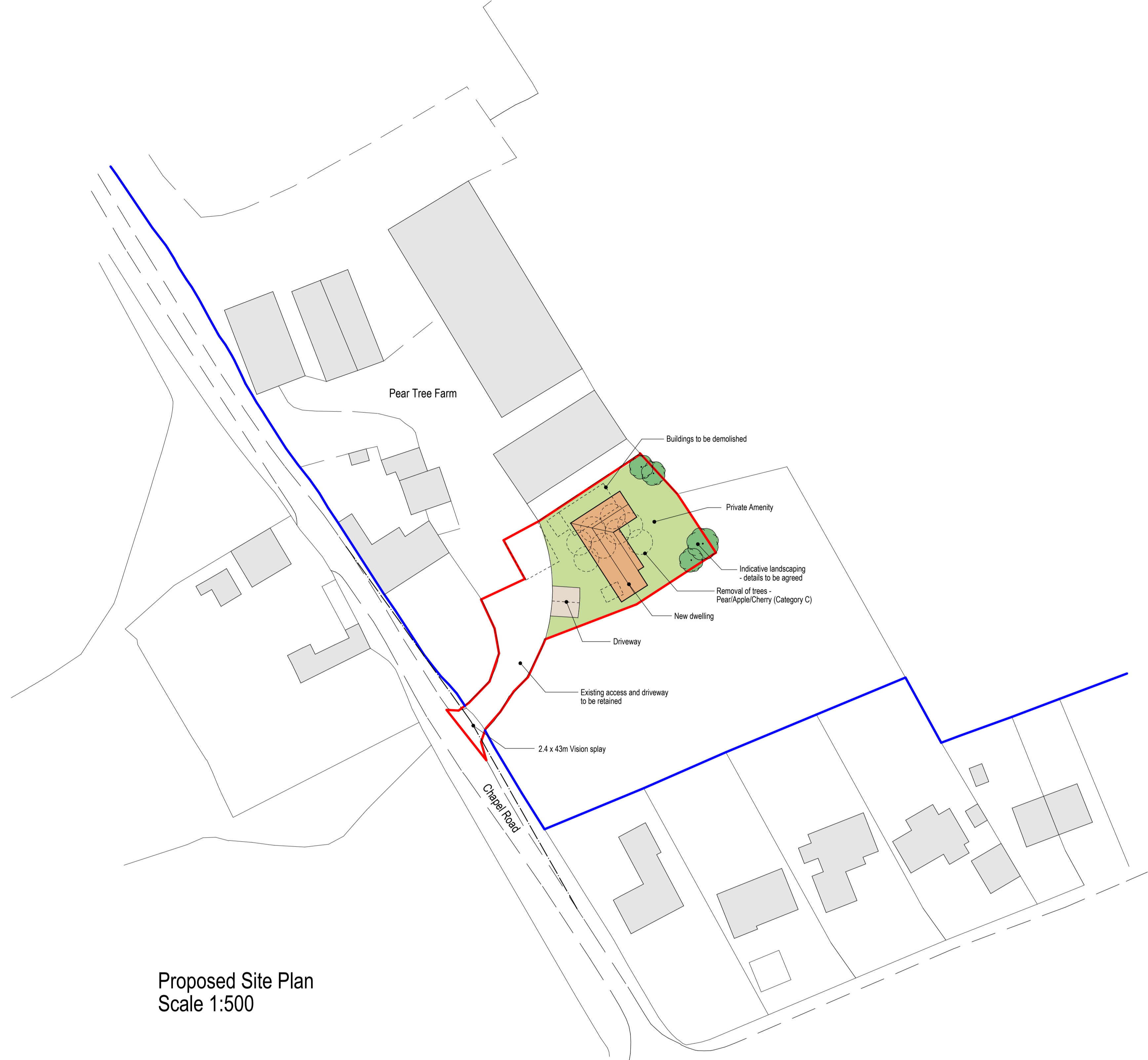
Proposed Site Plan Scale 1:500