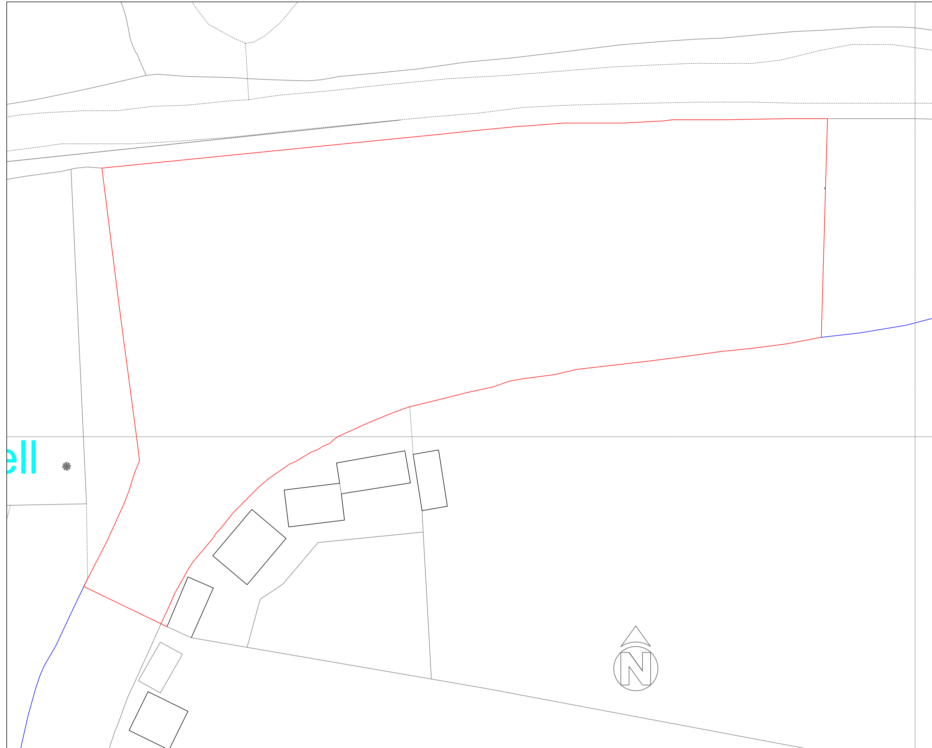
EXISTING SITE BLOCK PLAN SCALE: 1-200